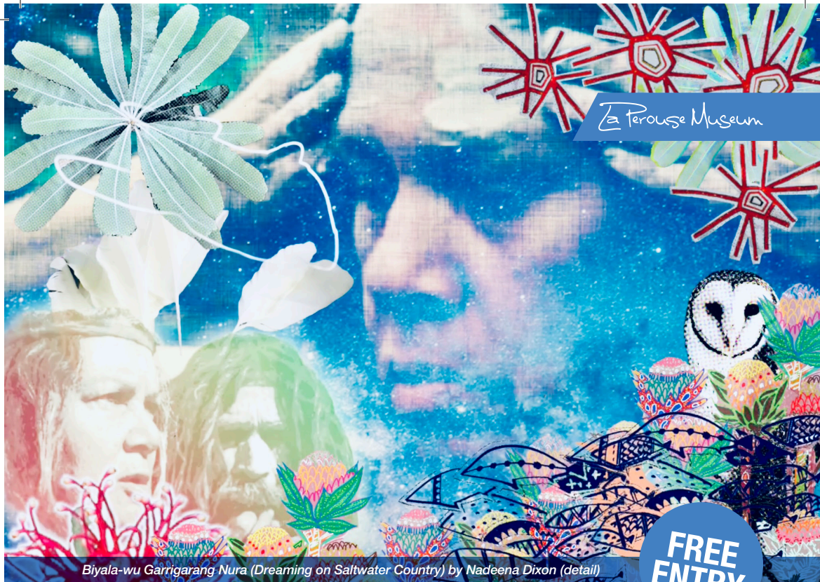
Biyala-wu Garrigarang Nura (Dreaming on Saltwater Country) by Nadeena Dixon (detail)