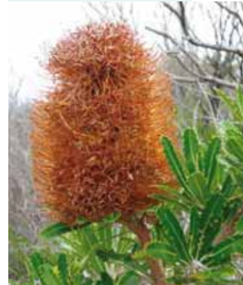
Old man banksia ( Banksia serrata ) is one plant often found growing in Eastern Suburbs Banksia Scrub communities.

Contact your local council to find out if they offer such a program.