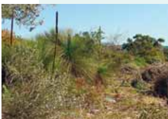
Preparing the York Road site for weeding and ecological burning.