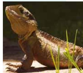
Eastern water dragons and other lizards use Eastern Suburbs Banksia Scrub as habitat.