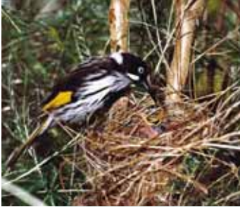
New Holland honeyeaters feed on the nectar from banksias found in Eastern Suburbs Banksia Scrub.