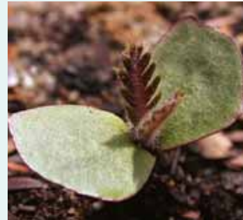
A Banksia serrata seedling regenerating after fire.

The group devises vegetation management plans which outline and guide the actions that need to be taken to protect, rehabilitate and manage Eastern Suburbs Banksia Scrub. Staff, professional bush regenerators and volunteers carry out bush regeneration by clearing areas of weeds and accumulated leaf litter so native plant seeds can germinate and plants can grow.