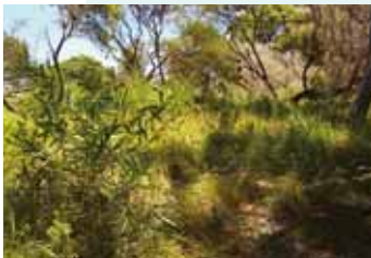
Eastern Suburbs Banksia Scrub at the Bird Sanctuary.