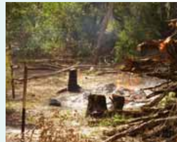
An ecological burn at the York Road site in October 2008.