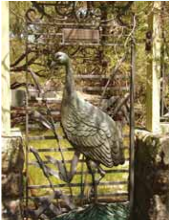
The Bird Sanctuary gate was constructed by the Gould League of Bird Lovers in the 1930s.