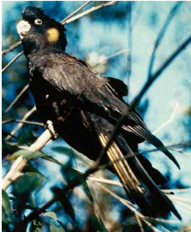
Yellow-tailed black cockatoos visit Eastern Suburb Banksia Scrub remnants when banksias are flowering.

For more information about Eastern Suburbs Banksia Scrub, contact DECC's Environment Line on 131 555.