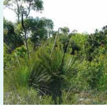
Eastern Suburbs Banksia Scrub.

Contact Centennial Park and Moore Park Trust on (02) 9339 6699 or visit www.yourparklands.org.au/volunteers/opportunities for information on how you can volunteer to restore Eastern Suburbs Banksia Scrub in Centennial Parklands.