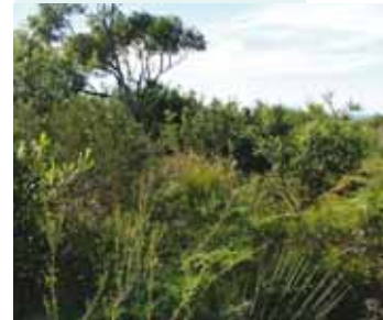
Eastern Suburbs Banksia Scrub.

Eastern Suburbs Banksia Scrub is an endangered diverse plant community growing on 100,000-year-old wind-blown dune sand on sandstone. The community once grew extensively on about 5,300 hectares of land between North Head and Botany Bay in Sydney, but less than 150 hectares (or about 3%) of the original extent remains. These remnants are scattered across Sydney's eastern and northern suburbs such as Randwick, Botany Bay and Manly.