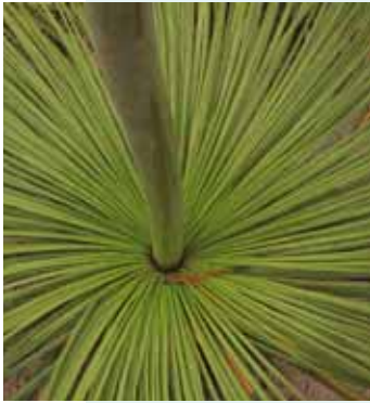
Grass trees are a common feature of Eastern Suburbs Banksia Scrub.