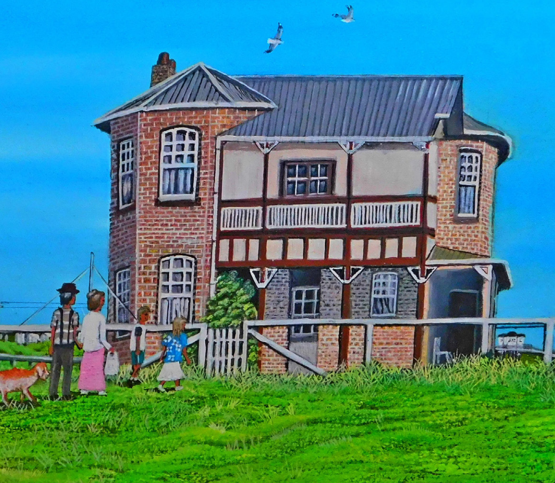
Craig Shepherd Old House of La Perouse, 2022 (detail)