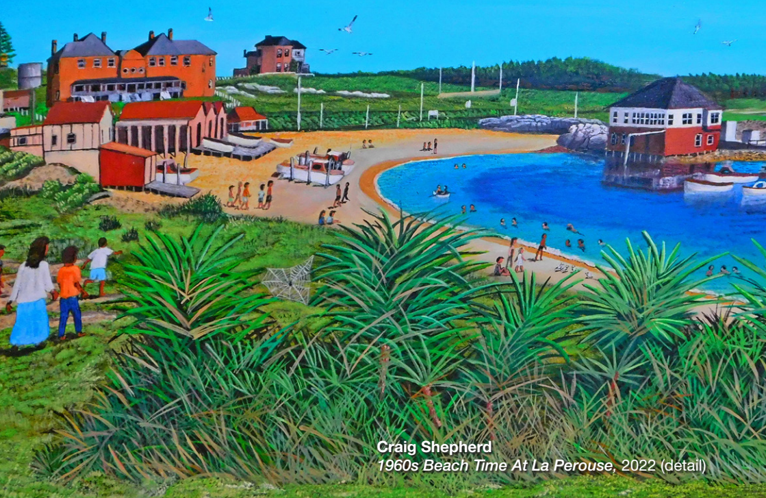
Craig Shepherd 1960s Beach Time At La Perouse, 2022 (detail)