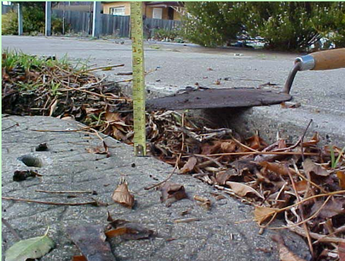
Photograph 1. Depicts a close view of the footpath and clearly indicates the difference in height between the footpath and the adjacent nature strip. Consider other methods such as mobile phones, coins etc.