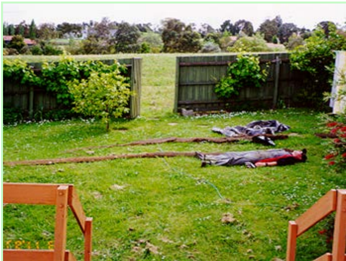
Photograph 2. An adult provides a point of reference regarding the length/size of a root mass removed from a private drain.