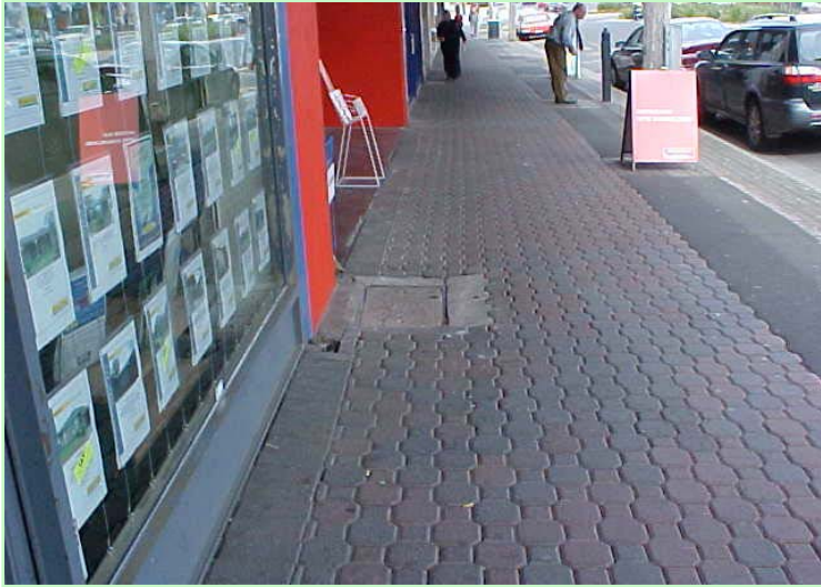
Photograph 4. Depicts a view of the subject street looking towards the east