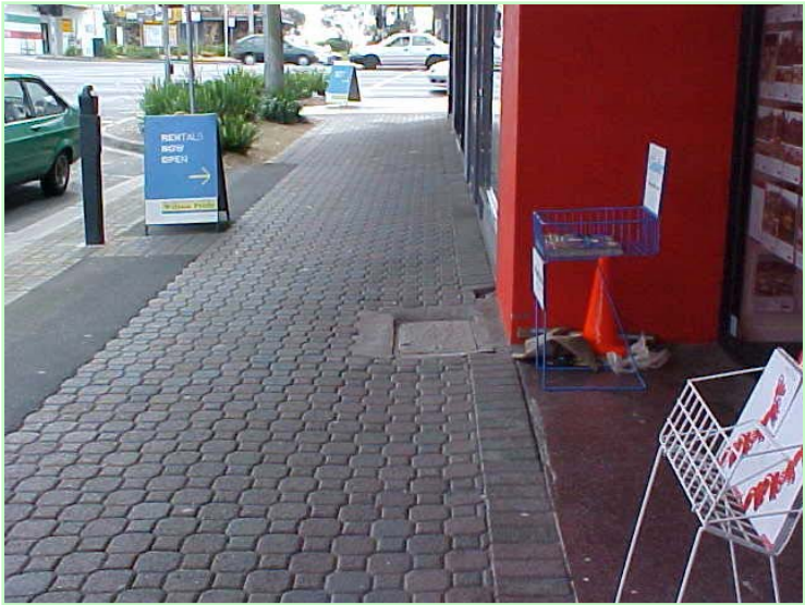
Photograph 3. Depicts a view of the subject street from a westerly direction.