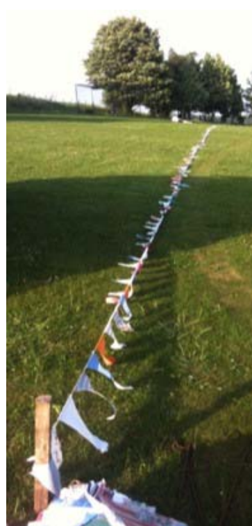
World Record 5km Continuous Handmade Celebration Bunting