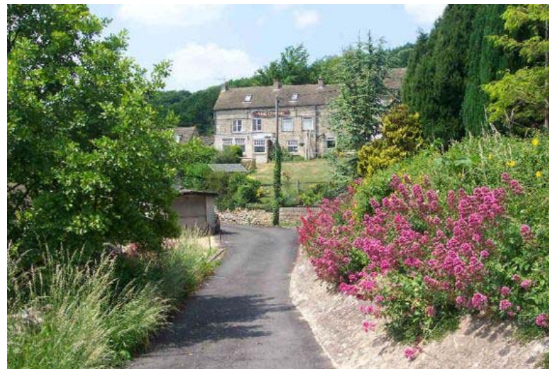
Orange Row, Randwick Village, Gloucestershire, England

The sister city relationship with Randwick, England was signed in 2009 celebrating the 150 year anniversary of Randwick City. There are very few Sister City relationships that can be traced back to one of the City's inception and are established on strong historical ties.