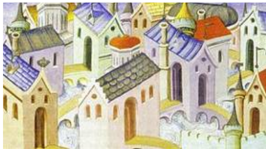
Hangzhou depicted in a 1412 French Illumination