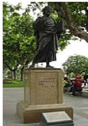
Statue of Marco Polo, West Lake