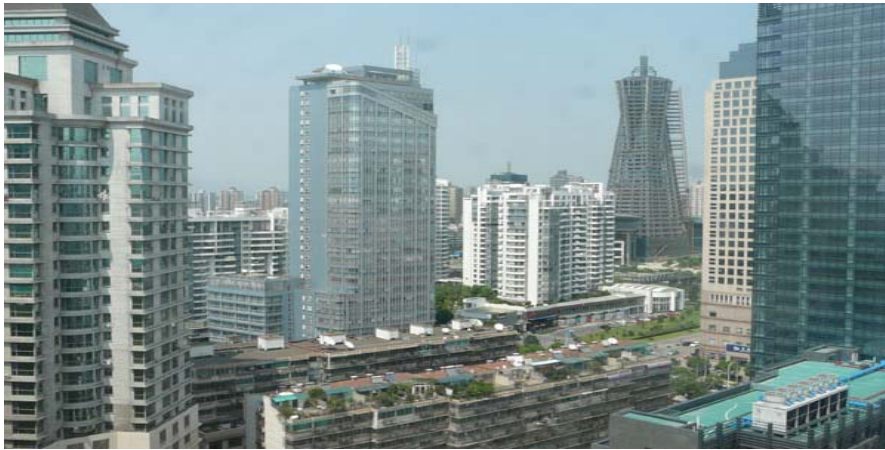
Hangzhou City, Zhejiang Province, Eastern China.