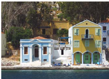
Brightly painted houses in Castellorizo