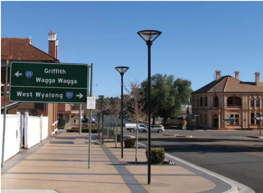
Temora Town Centre