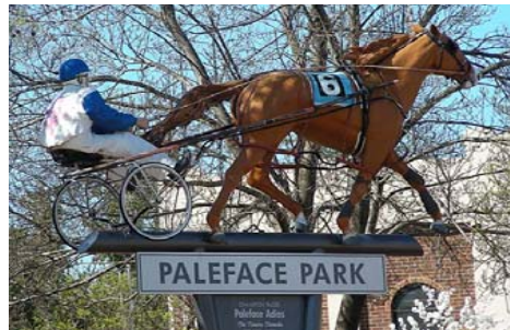
Statue of Paleface Adios at Paleface Park