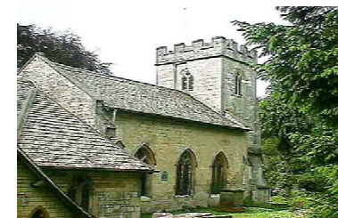
St Johns Parish Church, Randwick Village, Gloucestershire