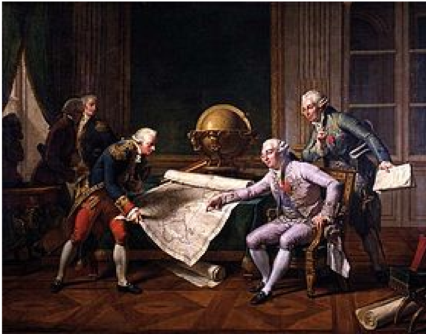
Louis XVI giving Lapérouse his instructions, 17 June 1785