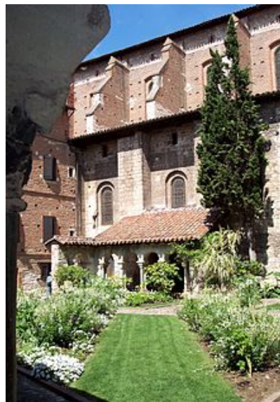
Collégiale Saint-Salvi, Albi, France