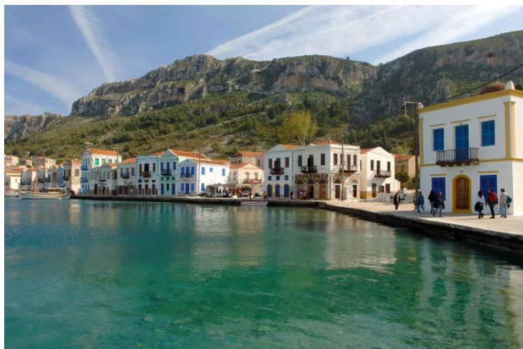
Village of Castellorizo, Greece