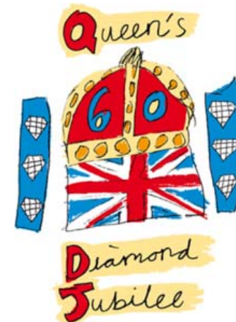
Queen Elizabeth II Diamond Jubilee 2012