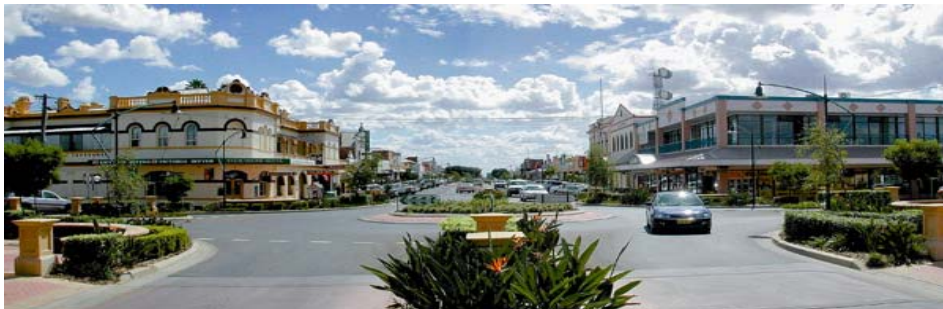
Narrabri Town Centre