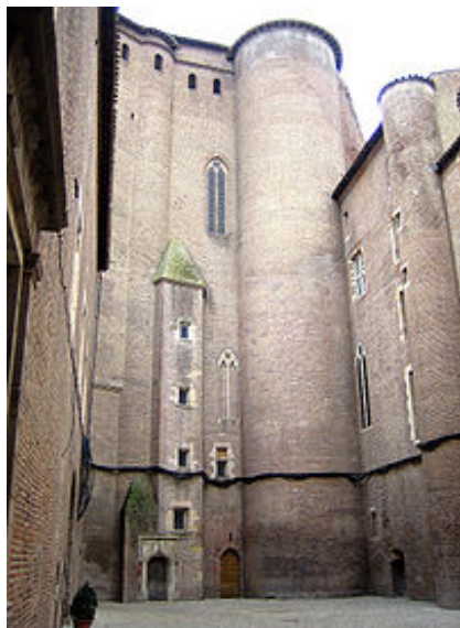
Toulouse Lautrec Museum, Albi, France