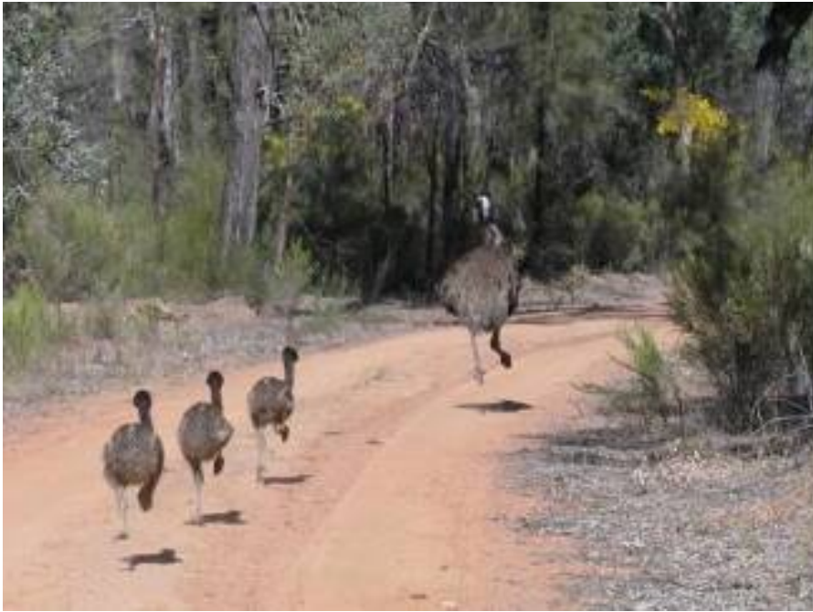
Pilliga Forrest, Narrabri