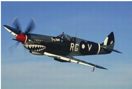
Temora's Mk VIII Spitfire