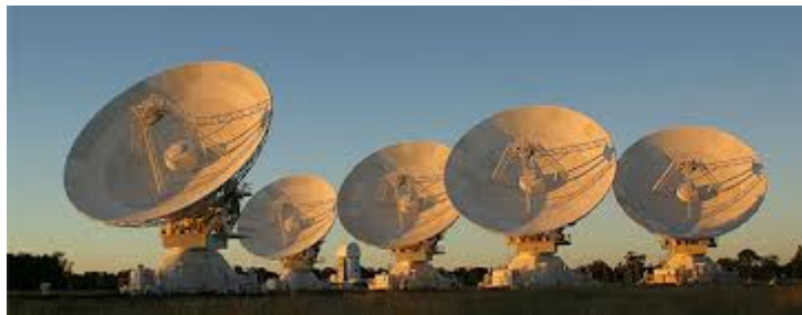
CSIRO Radio Telescopes, Narrabri