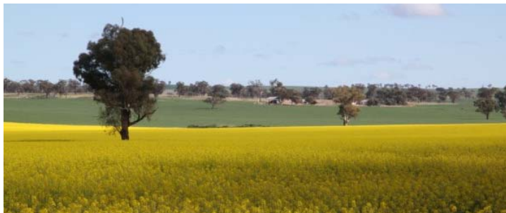
Canola Field, Temora