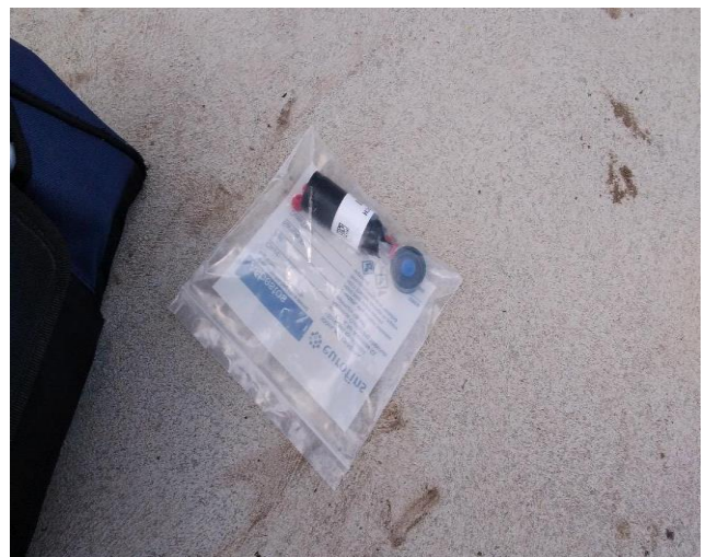
Location: Field blank Result: 0 fibres / 100 fields Image Id: 230228-120632