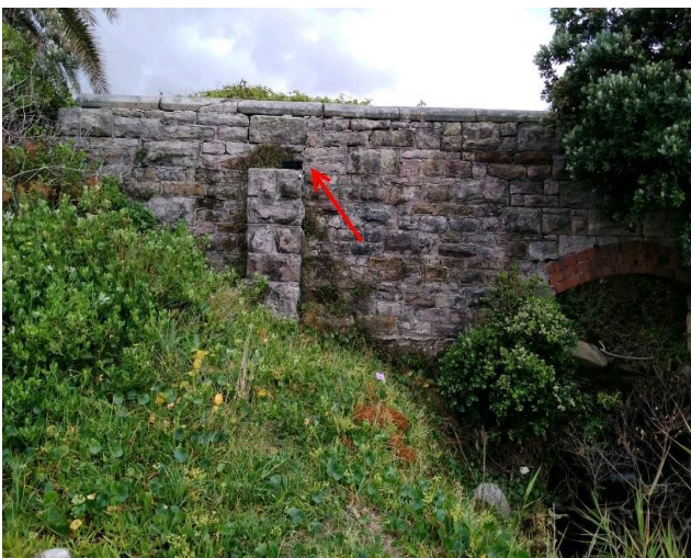
Location: Northern elevation, on stone retaining wall Result: <0.01 f/ml Image Id: 230228-095933