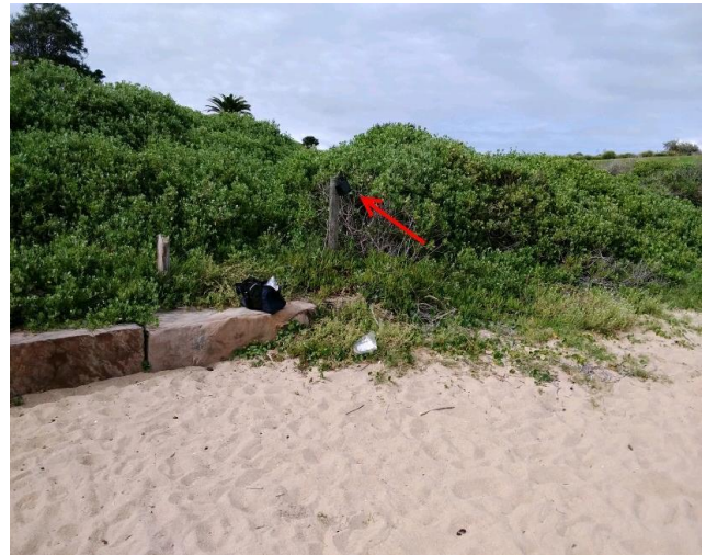
Location: Southern elevation, on pole Result: <0.01 f/ml Image Id: 230228-095230