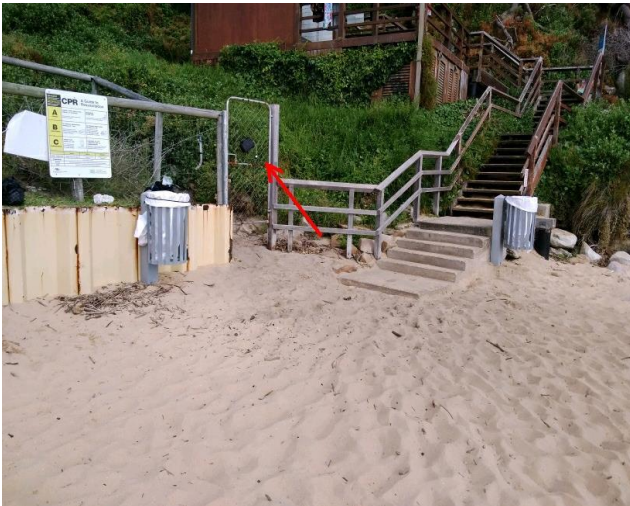
Location: Western elevation, Beach entry, on fence Result: <0.01 f/ml Image Id: 230228-094859