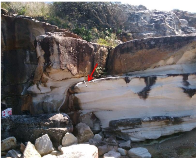
Location: Northern beach, on rock Result: <0.01 f/ml Image Id: 230109-101310