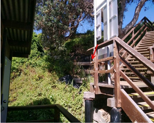
Location: Southern beach, at beach entrance Result: <0.01 f/ml Image Id: 230109-100103