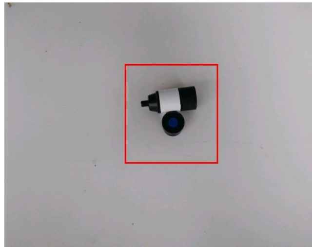
Location: Field Blank Result: 0 fibres / 100 fields Image Id: 230109-113158