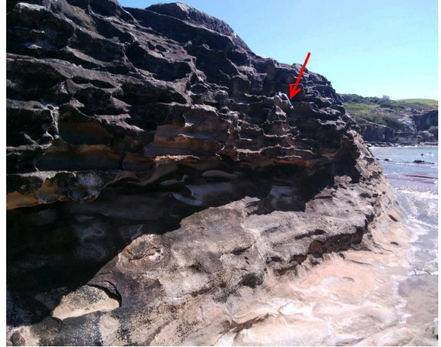
Location: Western beach, on rock Result: <0.01 f/ml Image Id: 230109-100717