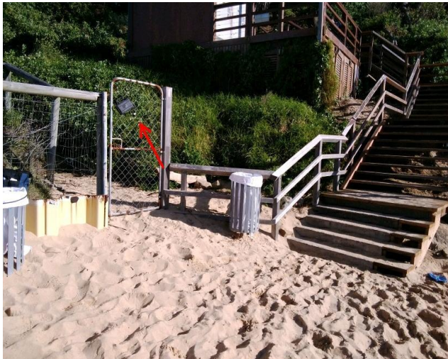
Location: Western elevation, Beach entry, on fence Result: <0.01 f/ml Image Id: 230703-093354