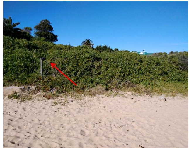
Location: Southern elevation, on pole Result: <0.01 f/ml Image Id: 230703-093424