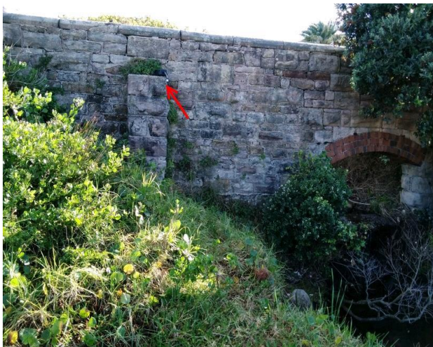
Location: Northern elevation, on stone retaining wall Result: <0.01 f/ml Image Id: 230703-093445