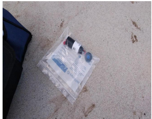
Location: Field blank Result: 0 fibres / 100 fields Image Id: 230703-093502