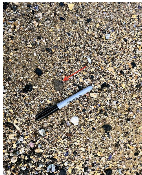
Notes: Overview of suspected FC Sheeting fragment within Northern Beach.