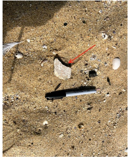
Notes: Overview of suspected FC Sheeting fragment within Western Beach.