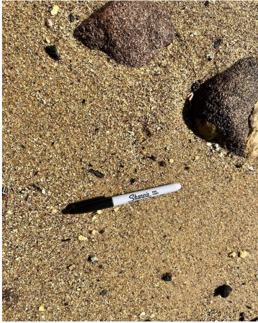
Notes: Visual surface clearance inspection following emu picking of suspected FC Sheeting fragment within Western Beach.