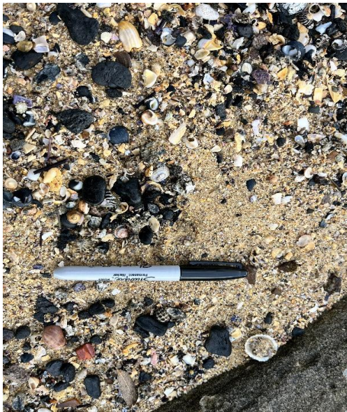
Notes: Visual surface clearance inspection following emu picking of suspected FC Sheeting fragment within Northern Beach.