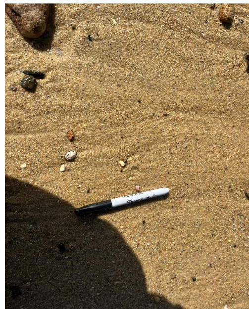
Notes: Visual surface clearance inspection following emu picking of suspected FC Sheeting fragment within Western Beach.