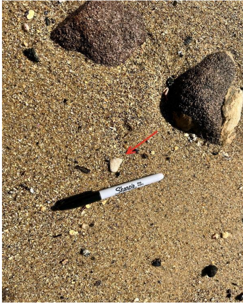
Notes: Overview of suspected FC Sheeting fragment within Western Beach.