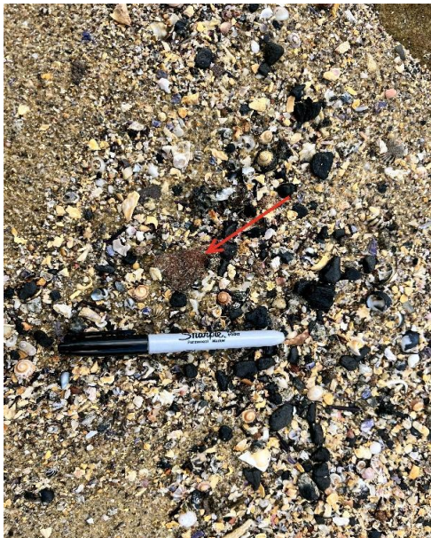
Notes: Overview of suspected FC Sheeting fragment within Northern Beach.