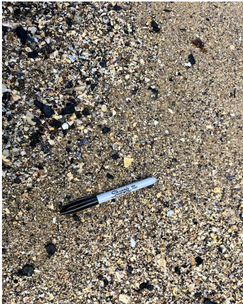
Notes: Visual surface clearance inspection following emu picking of suspected FC Sheeting fragment within Northern Beach.