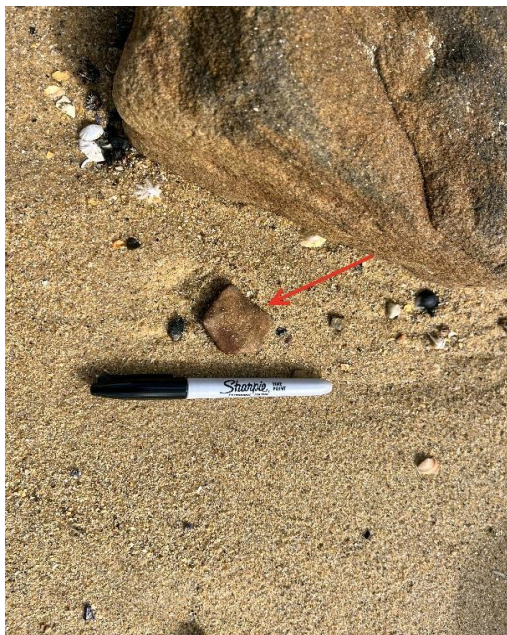
Notes: Overview of suspected FC Sheeting fragment within Western Beach.