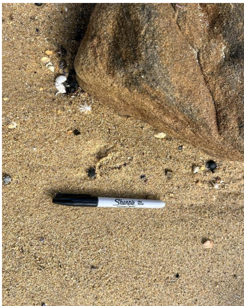
Notes: Visual surface clearance inspection following emu picking of suspected FC Sheeting fragment within Western Beach.