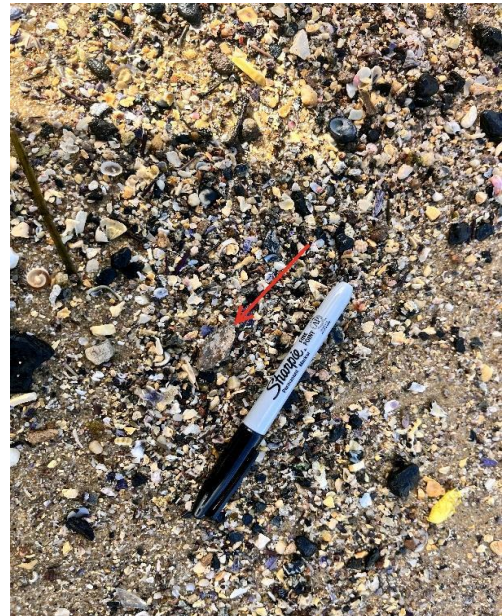
Notes: Overview of suspected FC Sheeting fragment within Northern Beach.