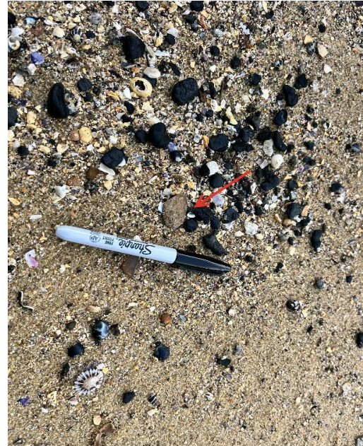
Notes: Overview of suspected FC Sheeting fragment within Northern Beach.