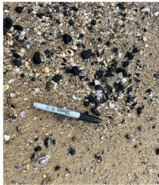
Notes: Visual surface clearance inspection following emu picking of suspected FC Sheeting fragment within Northern Beach.