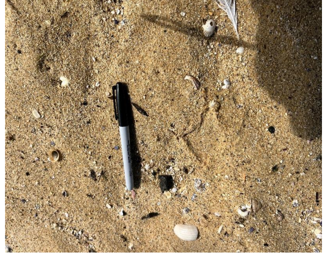
Notes: Visual surface clearance inspection following emu picking of suspected FC Sheeting fragment within Western Beach.