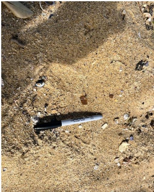
Notes: Visual surface clearance inspection following emu picking of suspected FC Sheeting fragment within Western Beach.