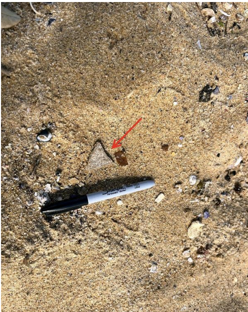
Notes: Overview of suspected FC Sheeting fragment within Western Beach.