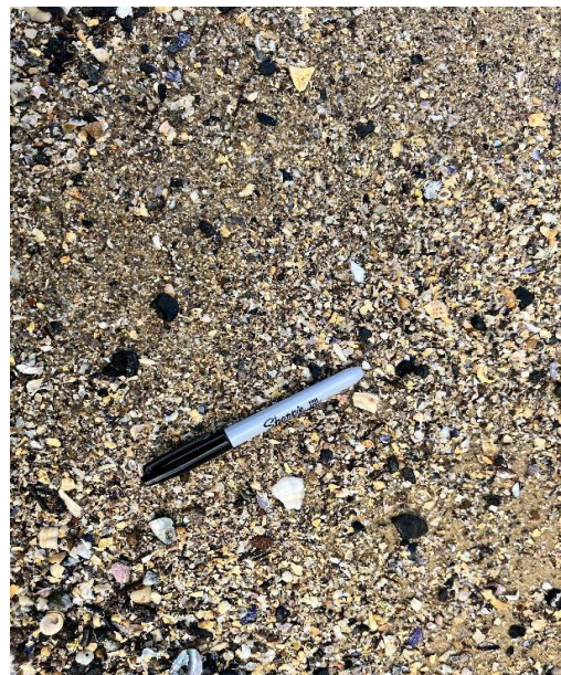
Notes: Visual surface clearance inspection following emu picking of suspected FC Sheeting fragment within Northern Beach.