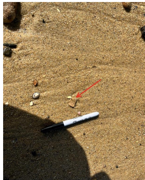
Notes: Overview of suspected FC Sheeting fragment within Western Beach.