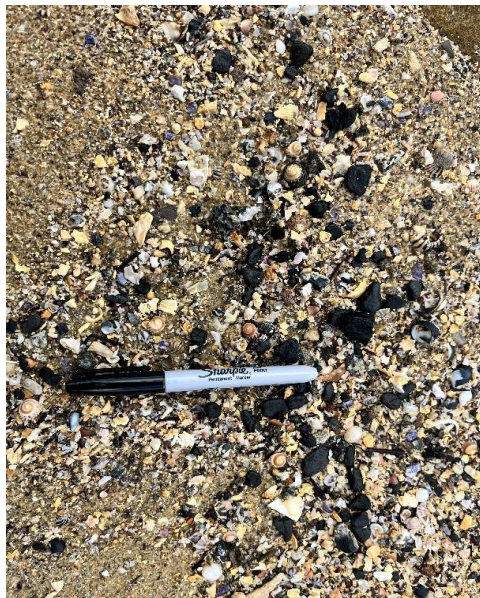
Notes: Visual surface clearance inspection following emu picking of suspected FC Sheeting fragment within Northern Beach.