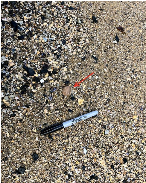
Notes: Overview of suspected FC Sheeting fragment within Northern Beach.