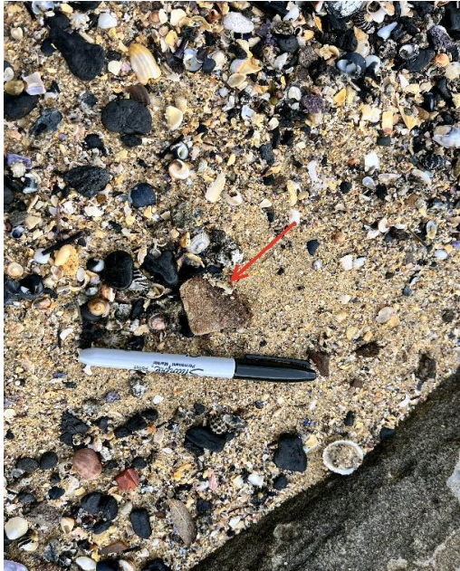
Notes: Overview of suspected FC Sheeting fragment within Northern Beach.