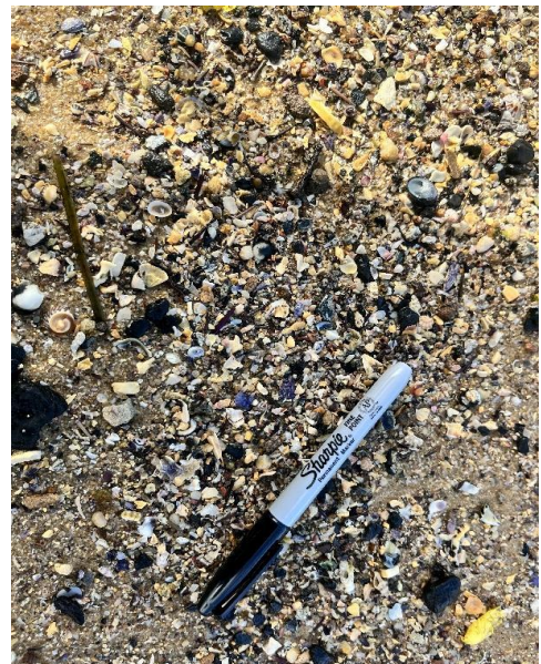
Notes: Visual surface clearance inspection following emu picking of suspected FC Sheeting fragment within Northern Beach.