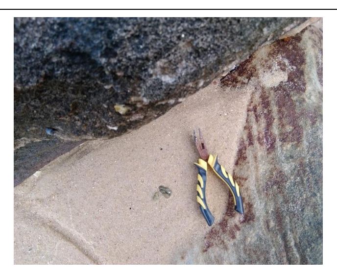
Notes: Sand surface following emu pick - Northern section