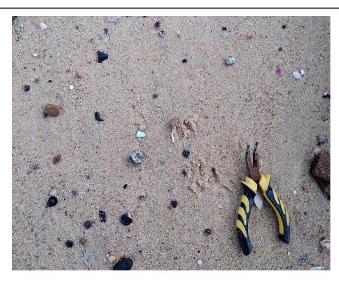
Notes: Sand surface following emu pick - Northern section