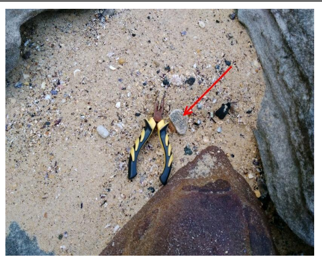
Notes: FC fragment identified on sand surface prior to emu pick - Northern section