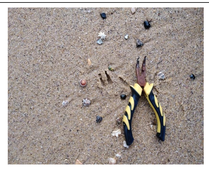
Notes: Sand surface following emu pick - Southern section