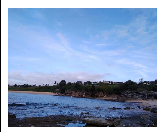
Notes: Overview of the Beach during the inspection