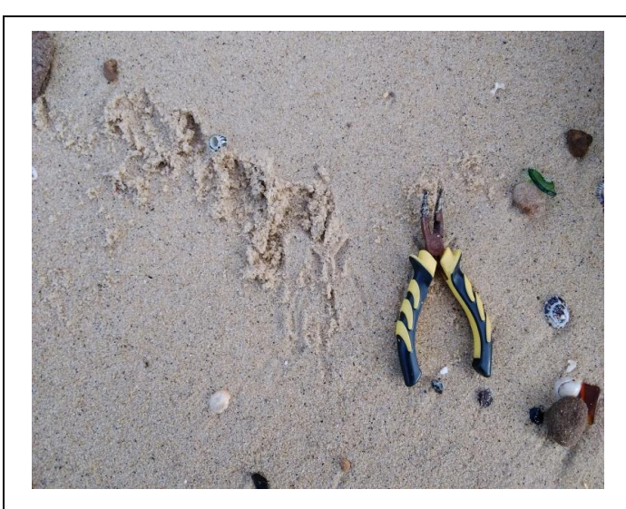
Notes: Sand surface following emu pick - Northern section