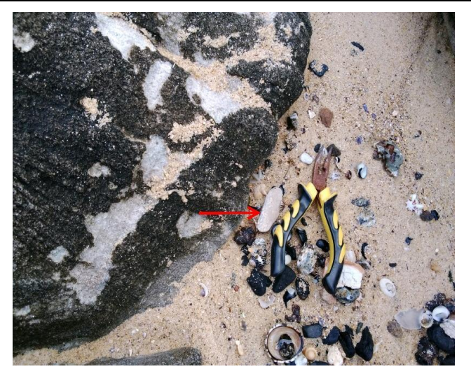
Notes: FC fragment identified on sand surface prior to emu pick - Northern section