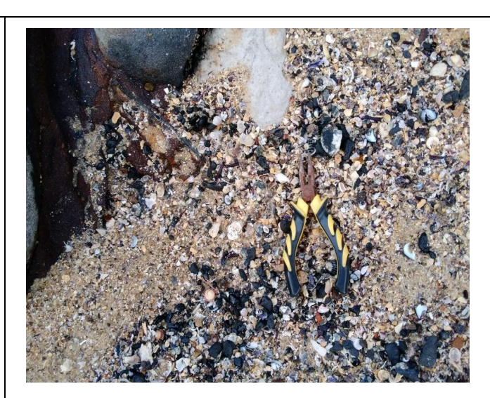
Notes: Sand surface following emu pick - Northern section