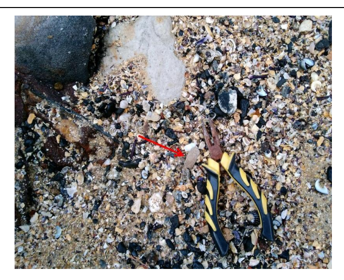
Notes: FC fragment identified on sand surface prior to emu pick - Northern section