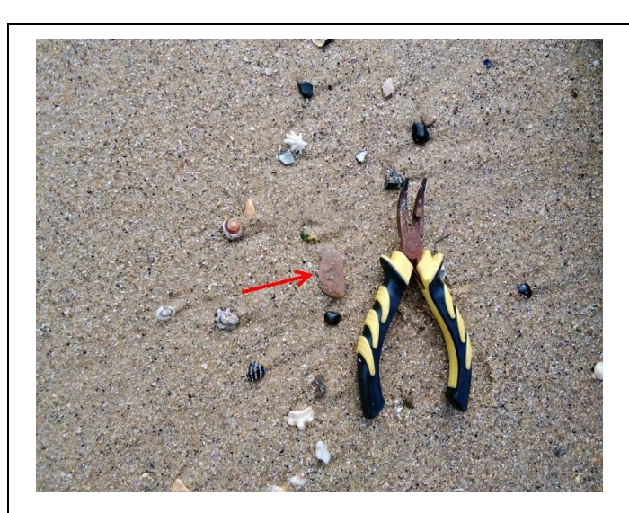
Notes: FC fragment identified on sand surface prior to emu pick - Southern section