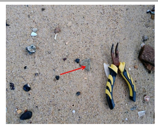
Notes: FC fragment identified on sand surface prior to emu pick - Northern section