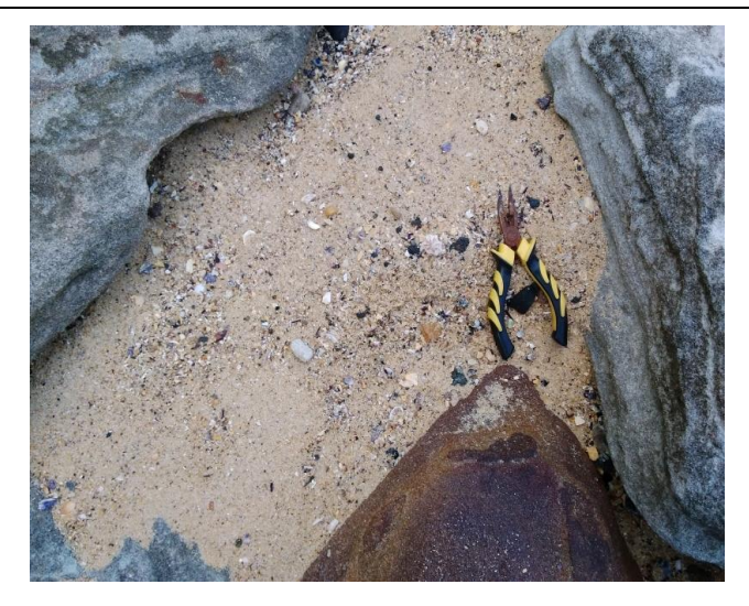
Notes: Sand surface following emu pick - Northern section