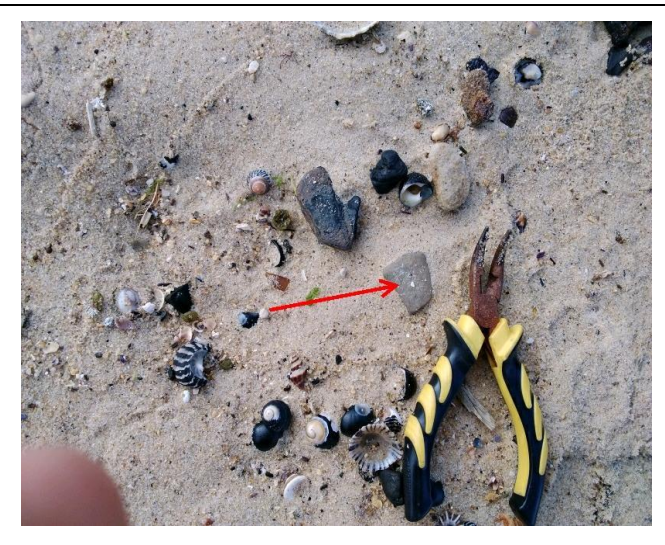
Notes: FC fragment identified on sand surface prior to emu pick - Western section