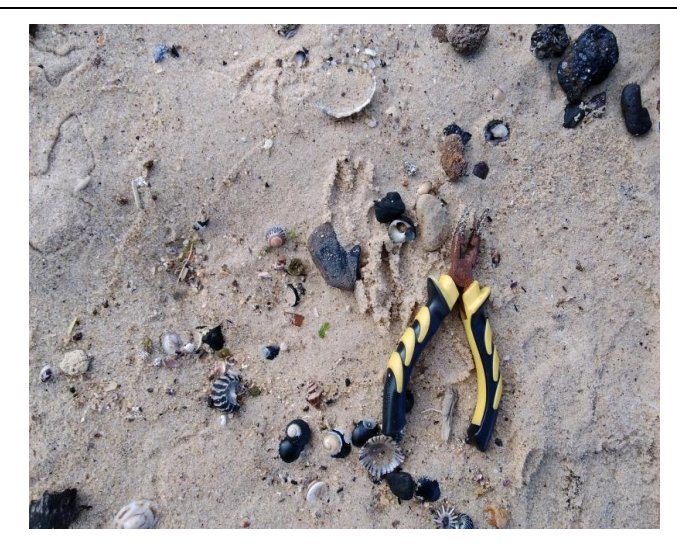
Notes: Sand surface following emu pick - Western section