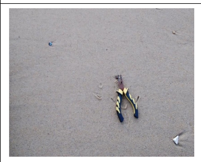
Notes: Sand surface following emu pick - Northern section