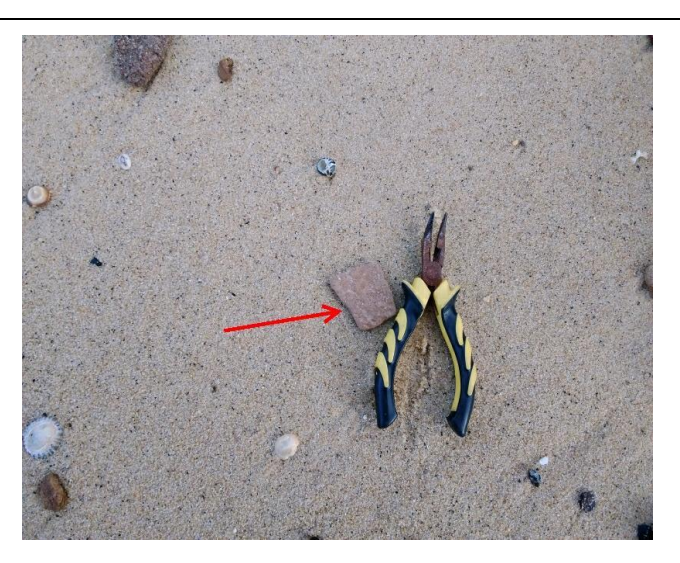
Notes: FC fragment identified on sand surface prior to emu pick - Northern section