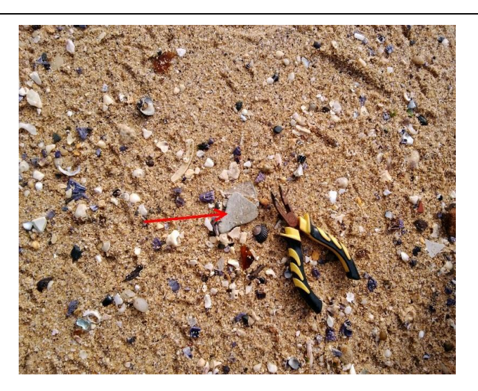
Notes: FC fragment identified on sand surface prior to emu pick - Southern section