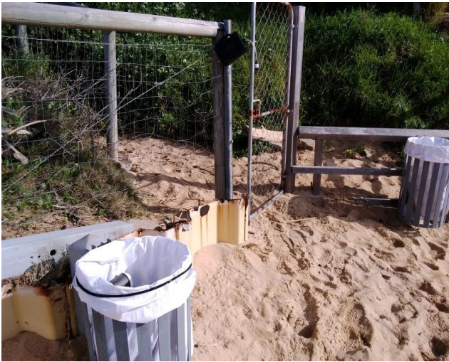
Location: Western elevation, Beach entry, on fence Result: <0.01 f/ml Image Id: 230613-102205