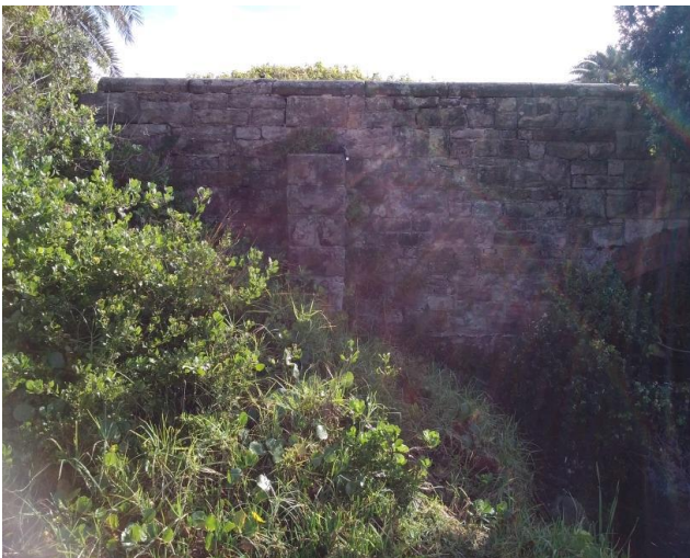
Location: Northern elevation, on stone retaining wall Result: <0.01 f/ml Image Id: 230613-102944