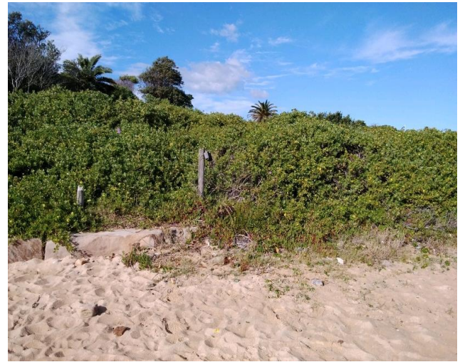
Location: Southern elevation, on pole Result: <0.01 f/ml Image Id: 230613-102412