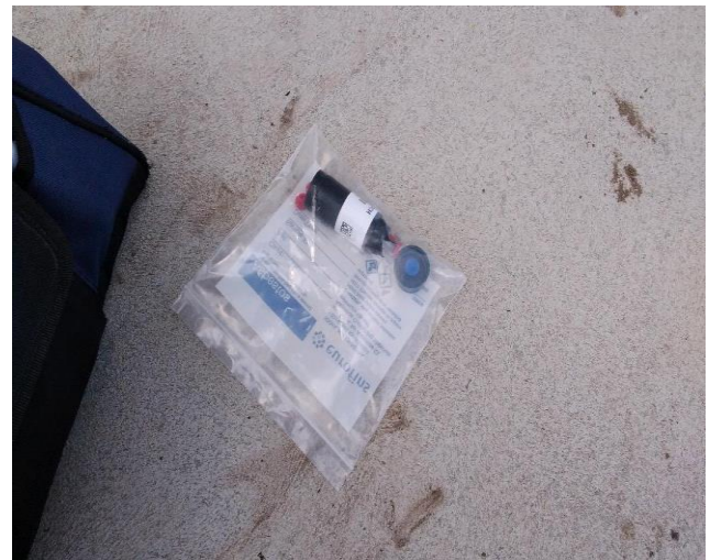
Location: Field blank Result: 0 fibres / 100 fields Image Id: 230613-103007