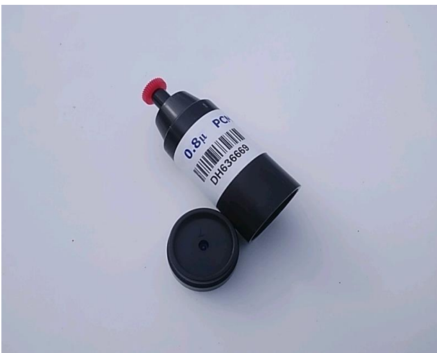
Location: Field Blank Result: 0 fibres / 100 fields Image Id: 230622-112001