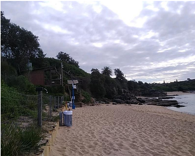
Location: Southern beach south end Result: <0.01 f/ml Image Id: 230622-094917