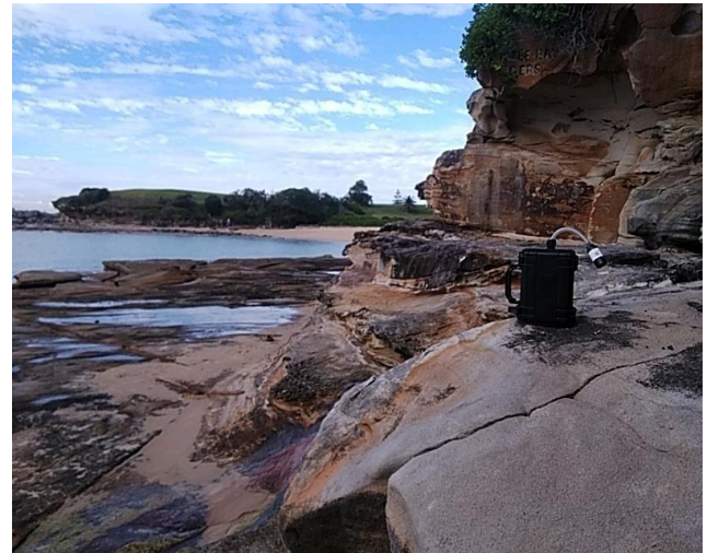
Location: Southern beach north end Result: <0.01 f/ml Image Id: 230622-095239