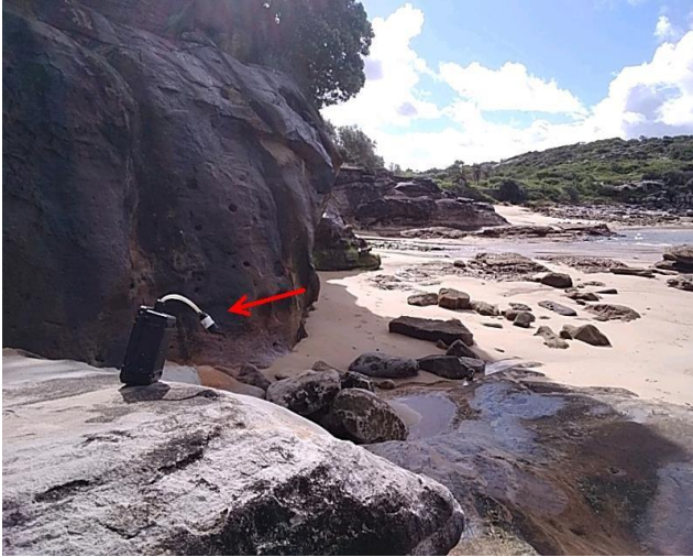
Location: Southern beach north end Result: <0.01 f/ml Image Id: 230518-120729