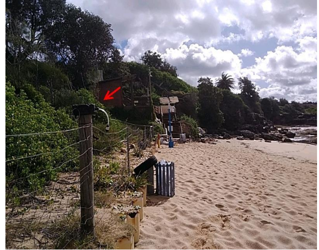
Location: Southern beach south end Result: <0.01 f/ml Image Id: 230518-121047