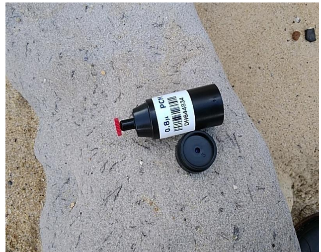
Location: Field blank Result: <0.01 f/ml Image Id: 230518-135526