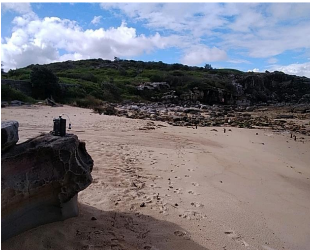
Location: Northern beach south end Result: <0.01 f/ml Image Id: 230518-124754