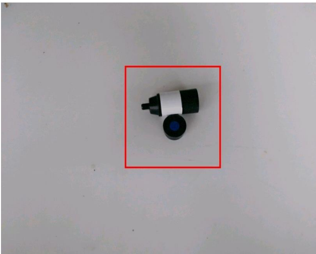
Location: Field Blank Result: 0 fibres / 100 fields Image Id: 230417-142614