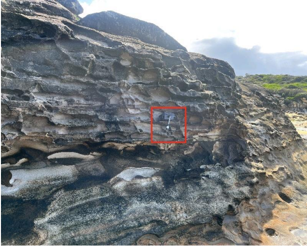
Location: Western Beach. Result: <0.01 f/ml Image Id: 230417-142320