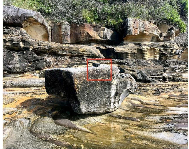
Location: Southern Beach. Result: <0.01 f/ml Image Id: 230417-142329