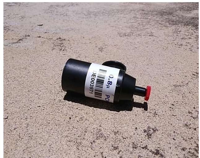
Location: Field blank Result: 0 fibres / 100 fields Image Id: 221215-130246