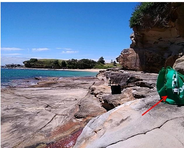
Location: Southern beach north end Result: <0.01 f/ml Image Id: 221215-114850