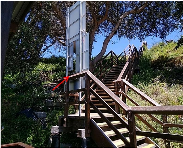
Location: Beach entrance Result: <0.01 f/ml Image Id: 221215-114327