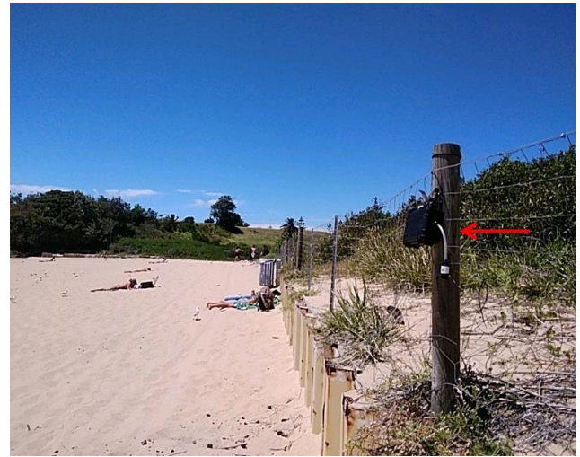
Location: Southern beach south end Result: <0.01 f/ml Image Id: 221215-114522