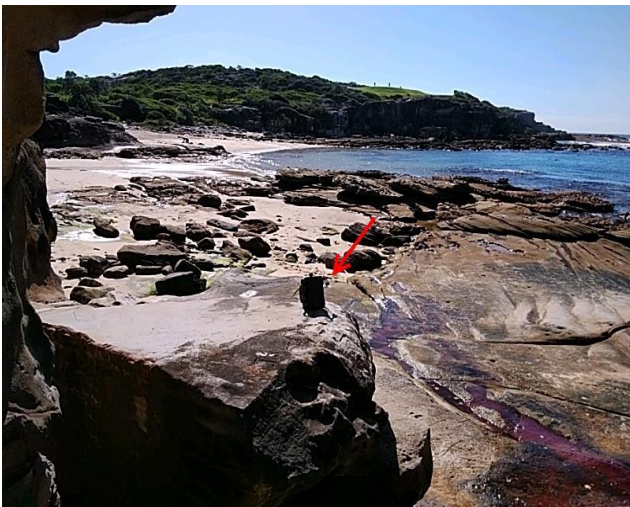
Location: Southern beach north end Result: <0.01 f/ml Image Id: 230428-101954