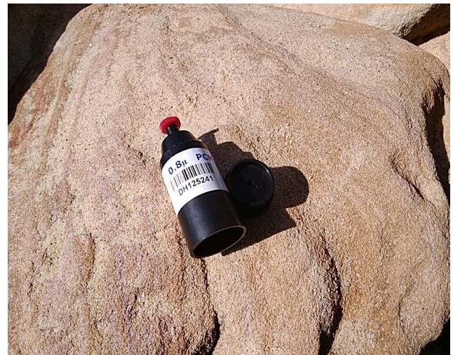
Location: Field blank Result: 0 fibres / 100 fields Image Id: 230428-111848