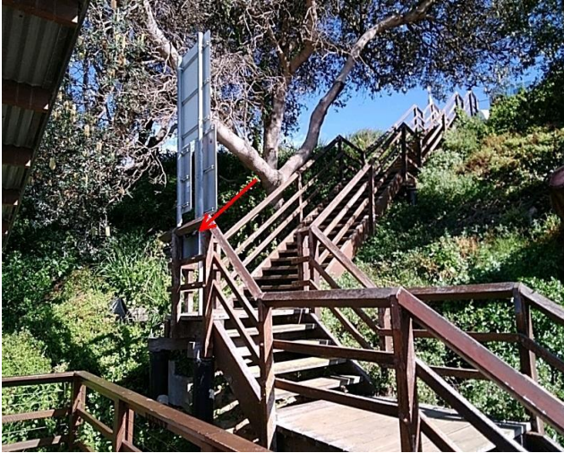
Location: Beach entrance Result: <0.01 f/ml Image Id: 230428-101510