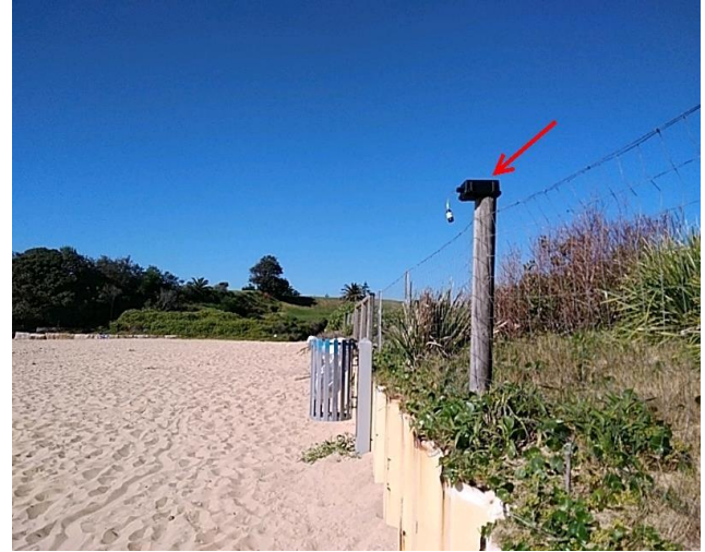
Location: Southern beach south end Result: <0.01 f/ml Image Id: 230428-101702