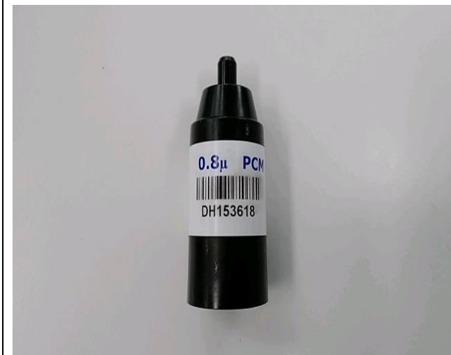
Location: Field blank Result: 0 fibres / 100 fields Image Id: 230314-112155