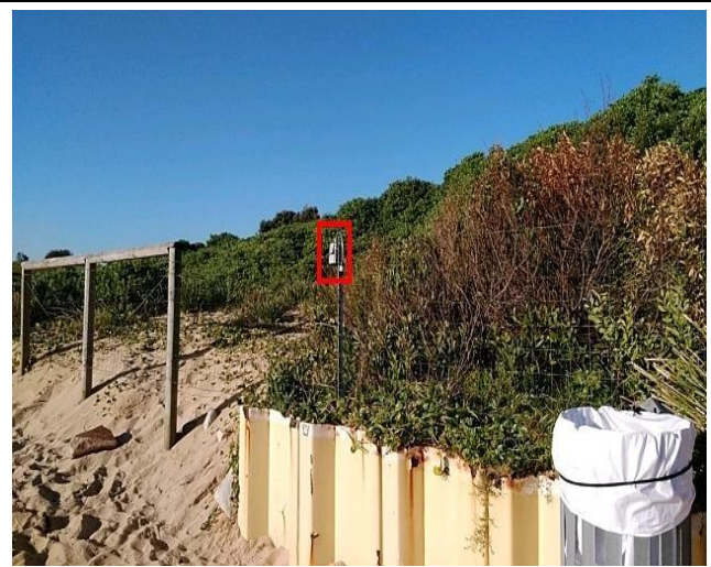
Location: South Beach, on boundary fence to dunes Result: <0.01 f/ml Image Id: 230311-080433