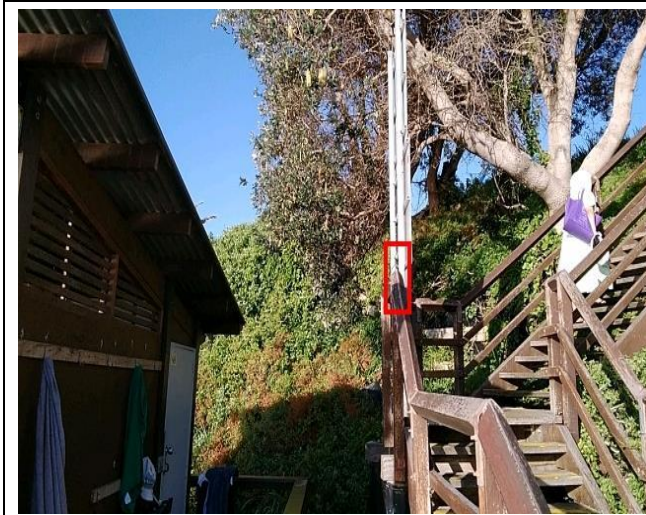
Location: Main entry to beach - southern beach Result: <0.01 f/ml Image Id: 230311-080242