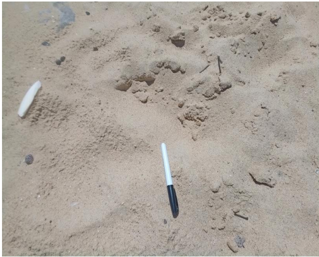
Notes: Visual surface clearance inspection following removal of ACM fragment.