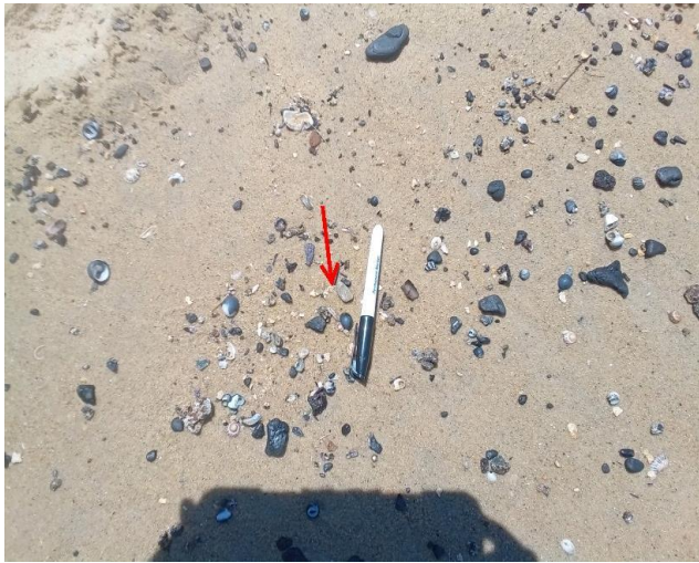
Notes: Overview of ACM fragment within Northern beach.