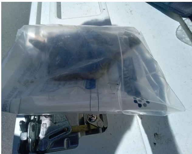
Notes: Visual surface clearance inspection following removal of ACM fragment.