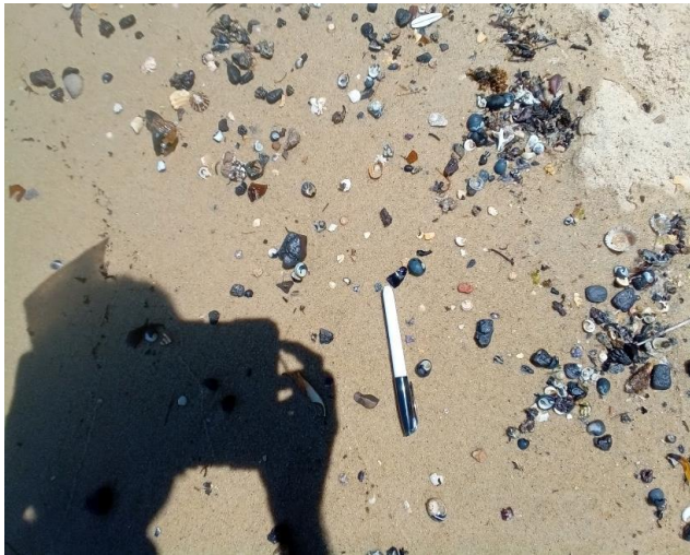
Notes: Visual surface clearance inspection following removal of ACM fragment.