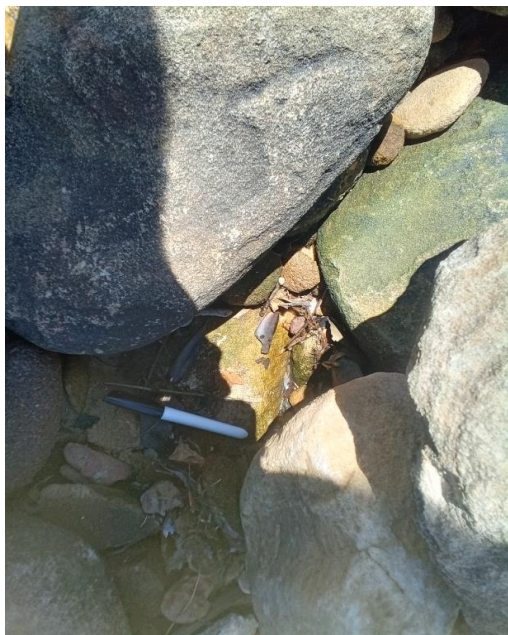
Notes: Visual surface clearance inspection following removal of ACM fragment.