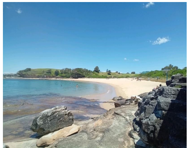
Notes: Overview of Southern beach.