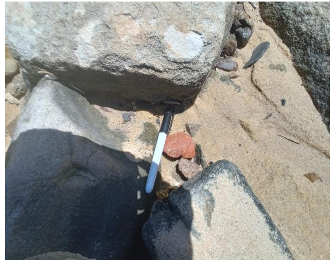
Notes: Visual surface clearance inspection following removal of ACM fragment.