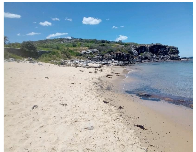
Notes: Overview of Northern beach.