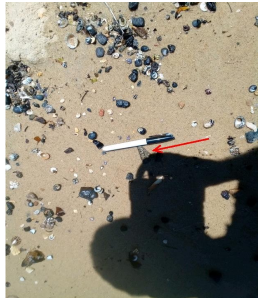
Notes: Overview of ACM fragment within Western beach.