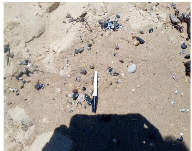
Notes: Visual surface clearance inspection following removal of ACM fragment.