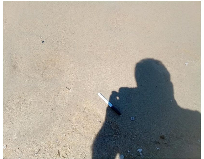
Notes: Visual surface clearance inspection following removal of ACM fragment.