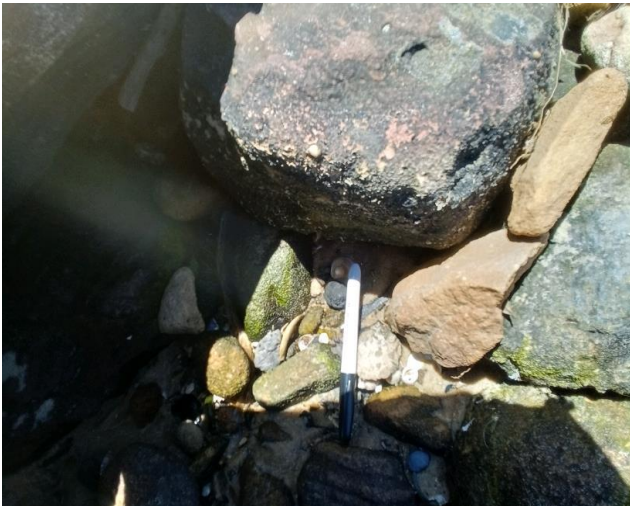
Notes: Visual surface clearance inspection following removal of ACM fragment.