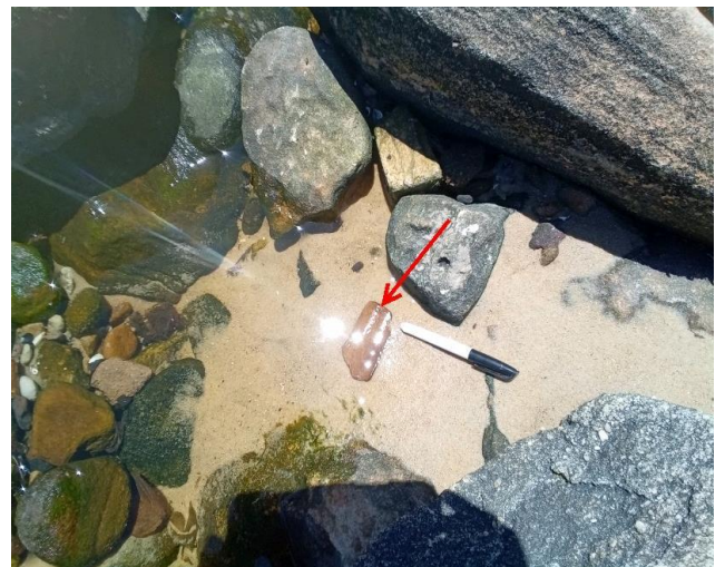
Notes: Overview of ACM fragment within Northern beach.