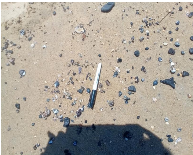
Notes: Visual surface clearance inspection following removal of ACM fragment.