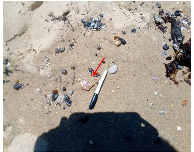
Notes: Overview of ACM fragment within Northern beach.