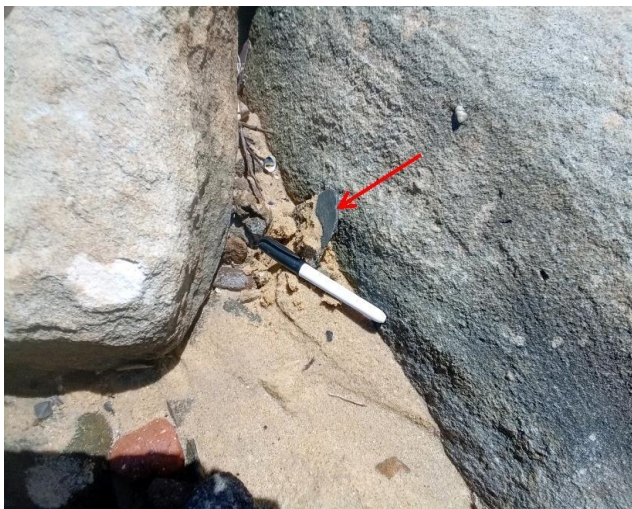
Notes: Overview of ACM fragment within Northern beach.