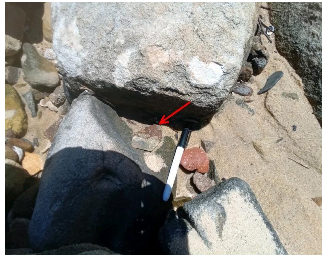
Notes: Overview of ACM fragment within Northern beach.