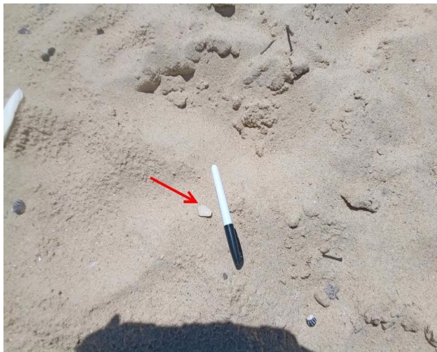
Notes: Overview of ACM fragment within Northern beach.