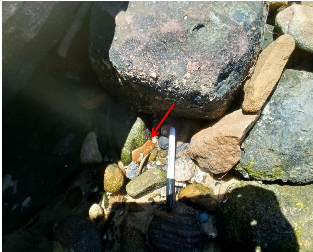
Notes: Overview of ACM fragment within Northern beach.