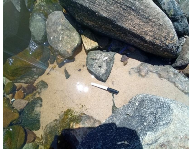
Notes: Visual surface clearance inspection following removal of ACM fragment.