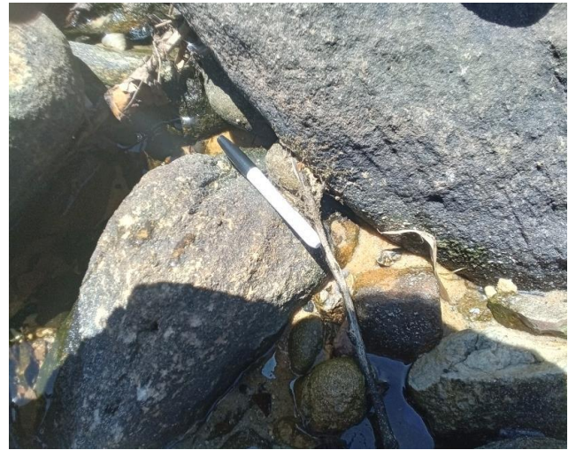
Notes: Visual surface clearance inspection following removal of ACM fragment.