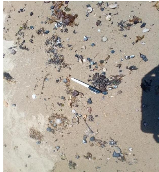
Notes: Visual surface clearance inspection following removal of ACM fragment.