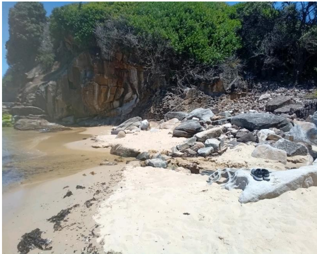
Notes: Overview of Western beach.