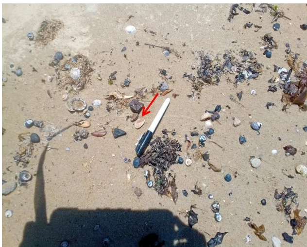
Notes: Overview of ACM fragment within Western beach.