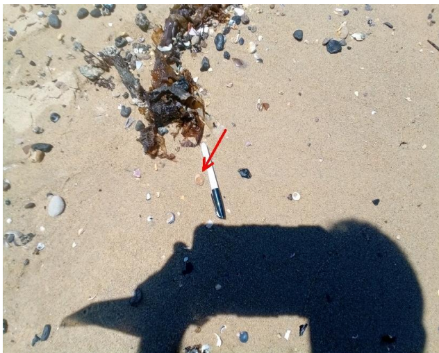
Notes: Overview of ACM fragment within Northern beach.