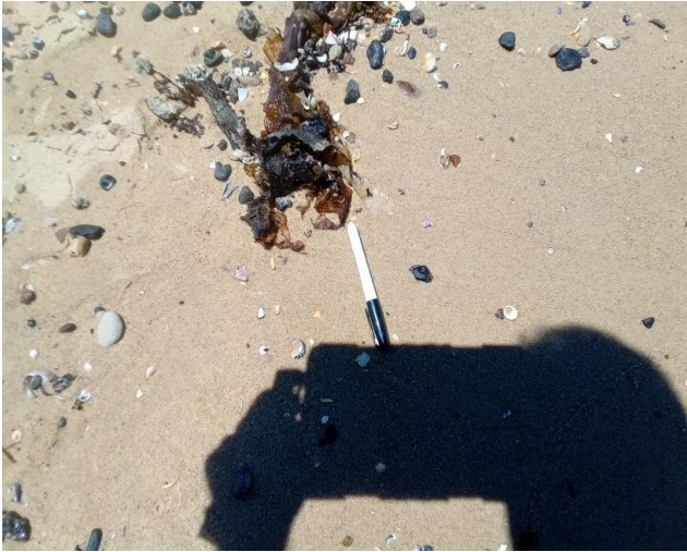
Notes: Visual surface clearance inspection following removal of ACM fragment.