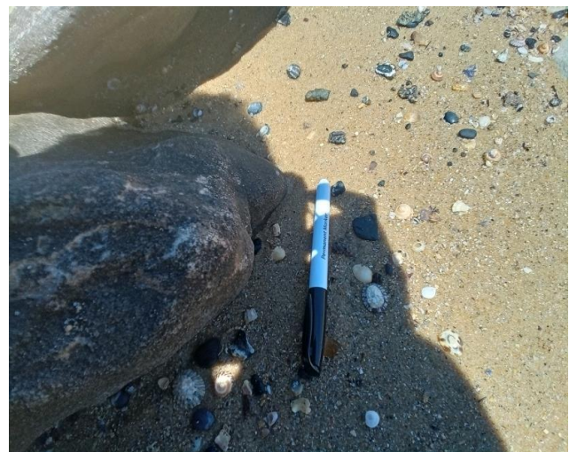
Notes: Visual surface clearance inspection following removal of ACM fragment.