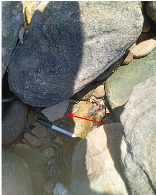
Notes: Overview of ACM fragment within Northern beach.