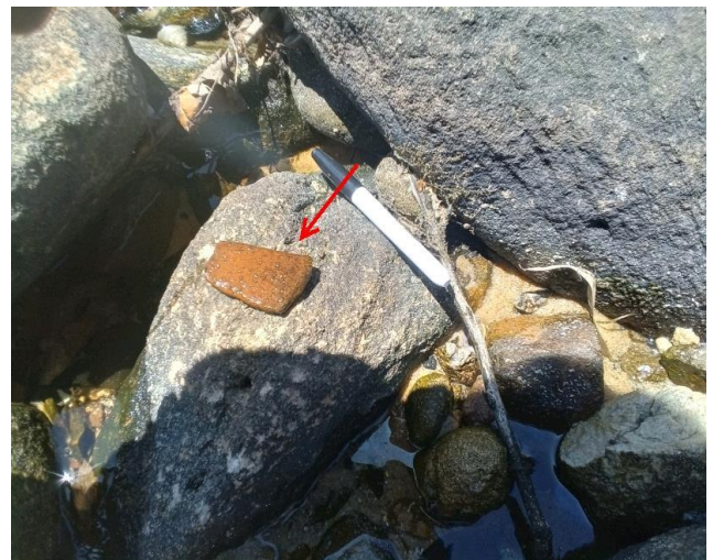
Notes: Overview of ACM fragment within Northern beach.