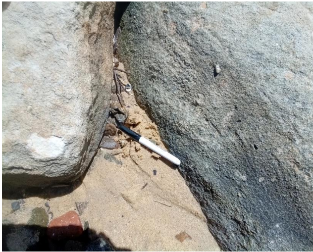
Notes: Visual surface clearance inspection following removal of ACM fragment.