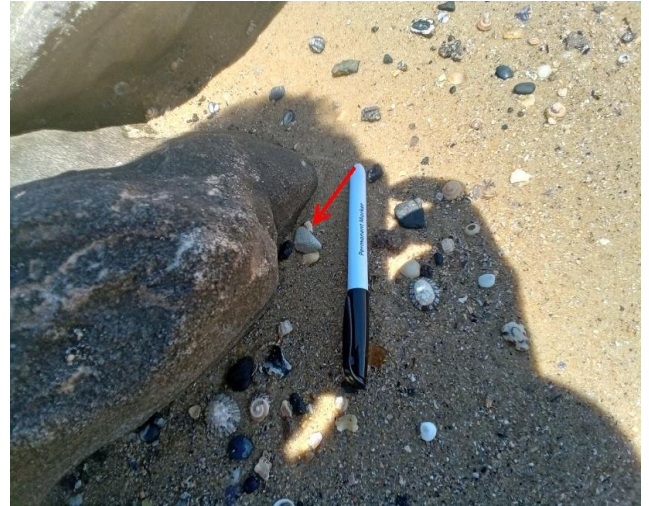
Notes: Overview of ACM fragment within Northern beach.