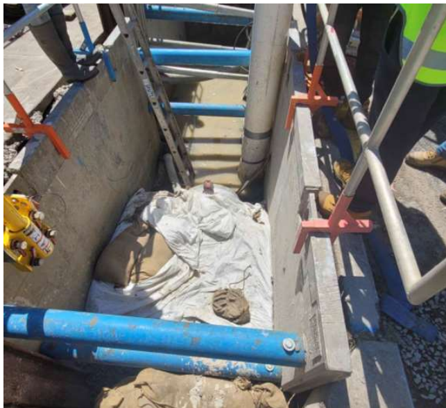
Stormwater works - Day Avenue at Doncaster Avenue