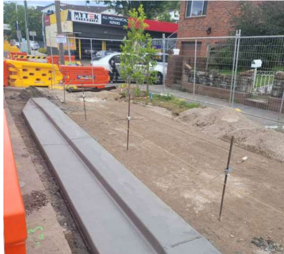
Kerbs for separated cycleway - Doncaster Avenue, south of Anzac Parade, facing south