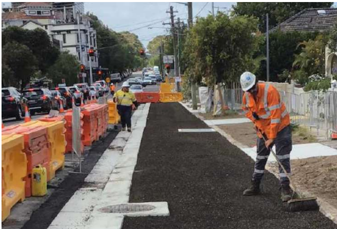
Pavement for separated cycleway - Doncaster Avenue, south of Anzac Parade, facing north