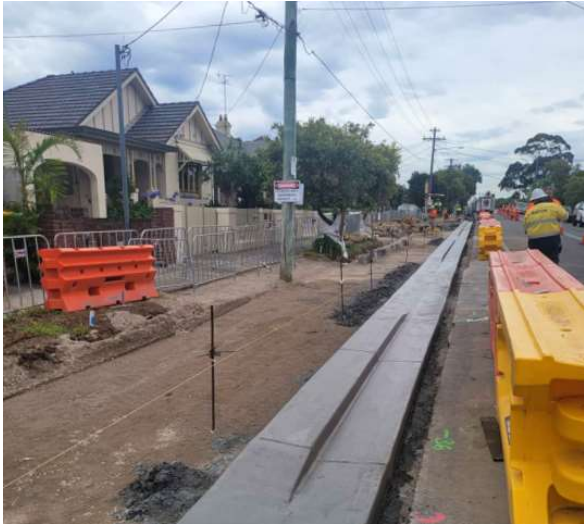
Kerbs for separated cycleway - Doncaster Avenue, south of Anzac Parade, facing south

Some photos of the latest works are shown below: