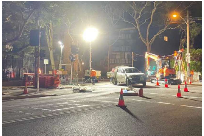
Traffic signal works - Doncaster Avenue at Todman Avenue