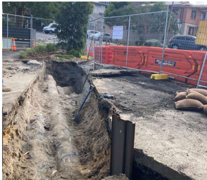
Stormwater works - Houston Road at Barker Street