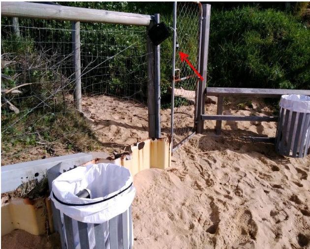
Location: Western elevation, Beach entry, on fence Result: <0.01 f/ml Image Id: 230617-102515