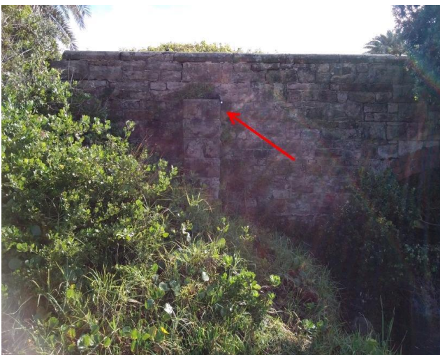
Location: Northern elevation, on stone retaining wall Result: <0.01 f/ml Image Id: 230617-102553