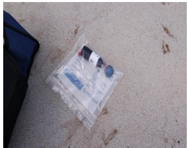
Location: Field blank Result: 0 fibres / 100 fields Image Id: 230617-102602