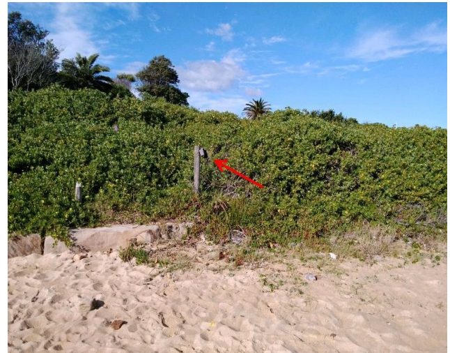
Location: Southern elevation, on pole Result: <0.01 f/ml Image Id: 230617-102541