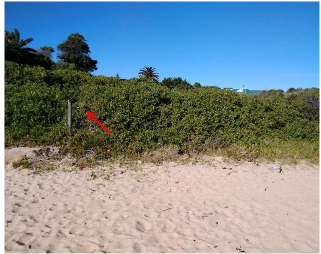
Location: Southern elevation, on pole Result: <0.01 f/ml Image Id: 230711-102516