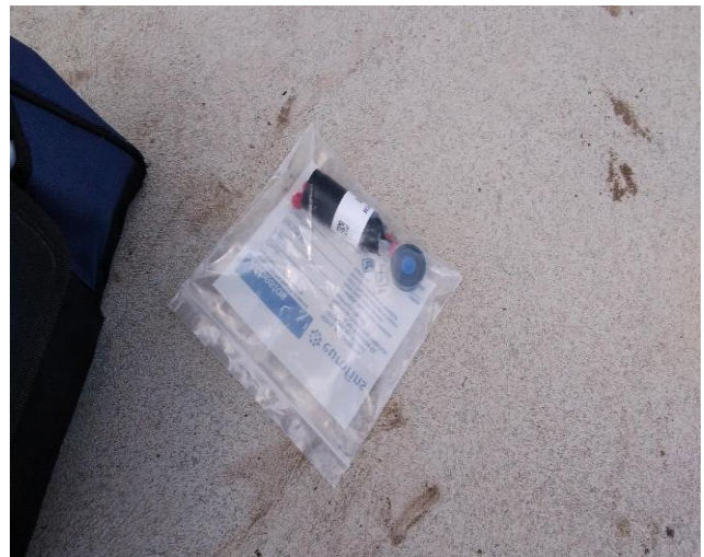
Location: Field blank Result: 0 fibres / 100 fields Image Id: 230711-102602