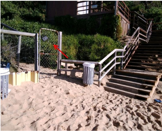
Location: Western elevation, Beach entry, on fence Result: <0.01 f/ml Image Id: 230711-102347