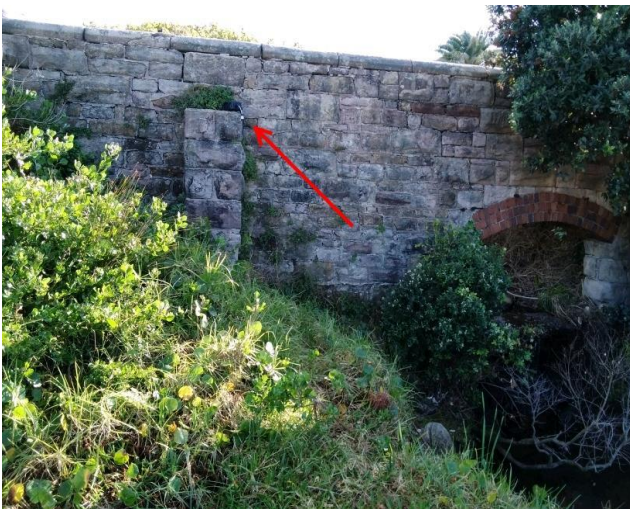
Location: Northern elevation, on stone retaining wall Result: <0.01 f/ml Image Id: 230711-102553