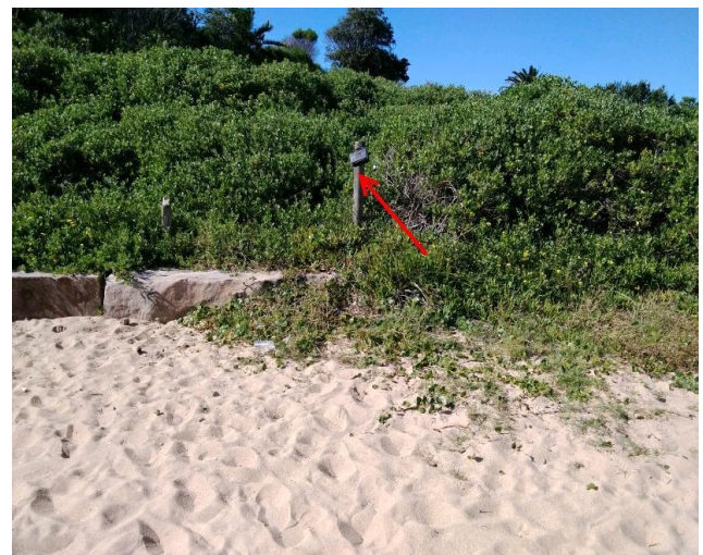
Location: Southern elevation, on pole Result: <0.01 f/ml Image Id: 230330-101237