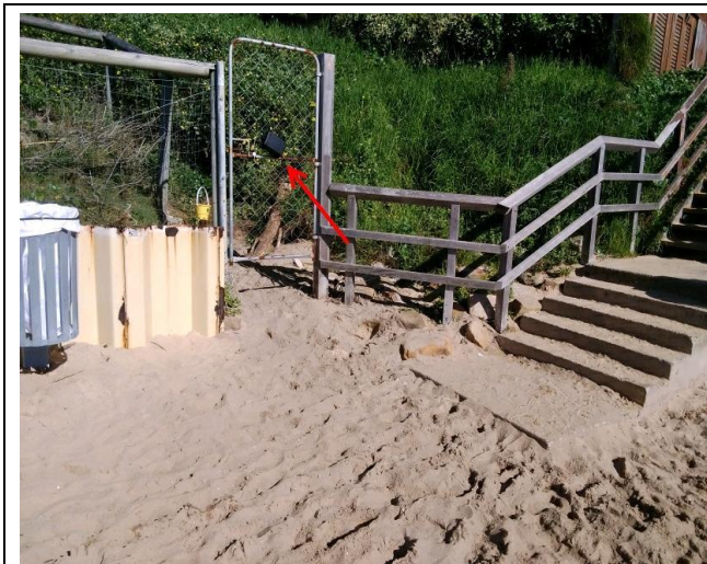
Location: Western elevation, Beach entry, on fence Result: <0.01 f/ml Image Id: 230330-100942