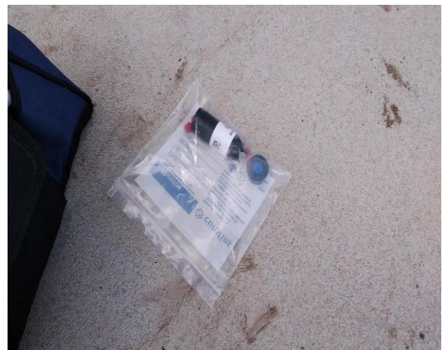
Location: Field blank Result: 0 fibres / 100 fields Image Id: 230330-101906