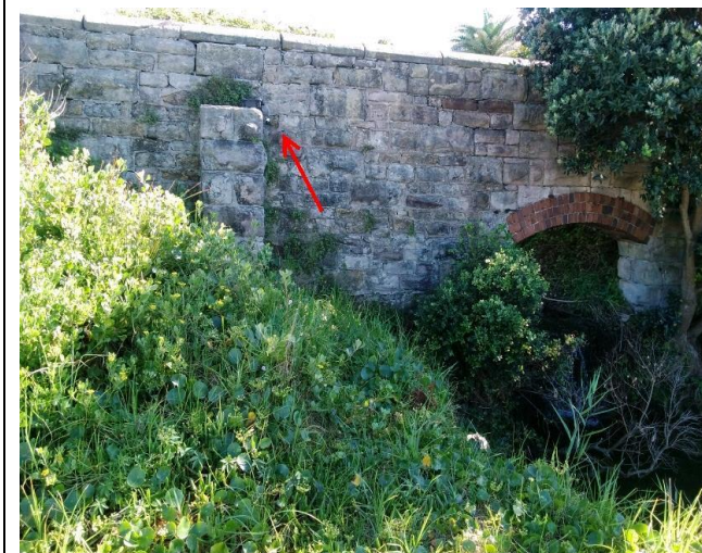
Location: Northern elevation, on stone retaining wall Result: <0.01 f/ml Image Id: 230330-101830