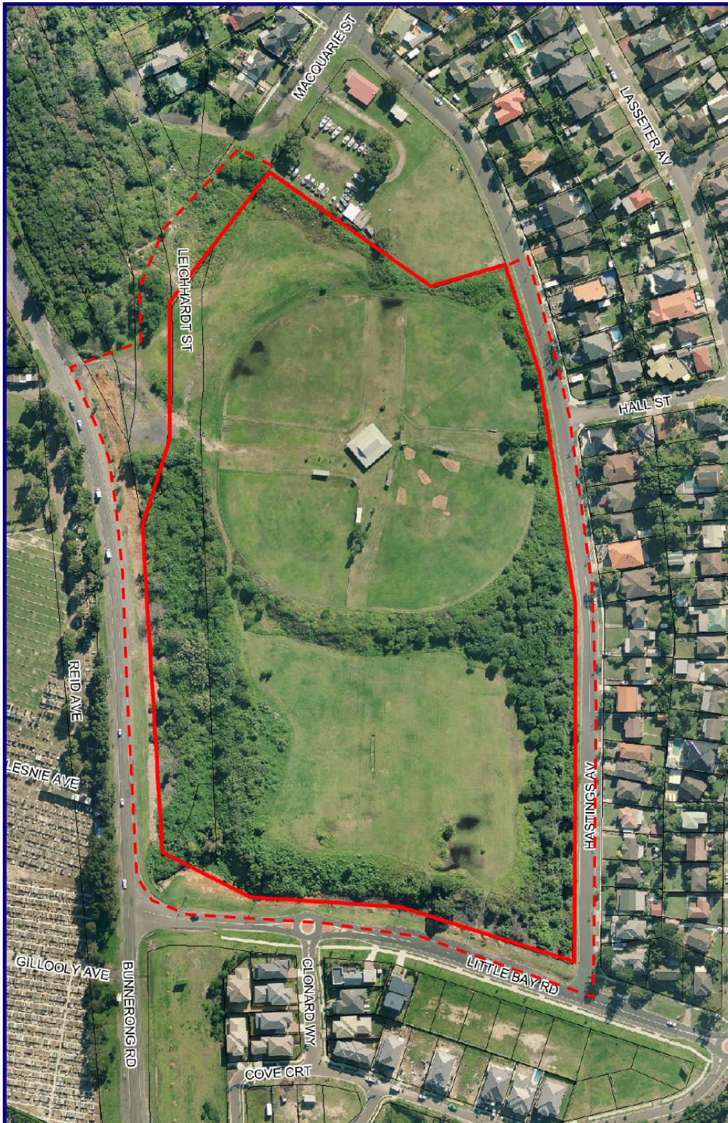
Fig 2: Aerial Photo showing current layout and adjoining uses