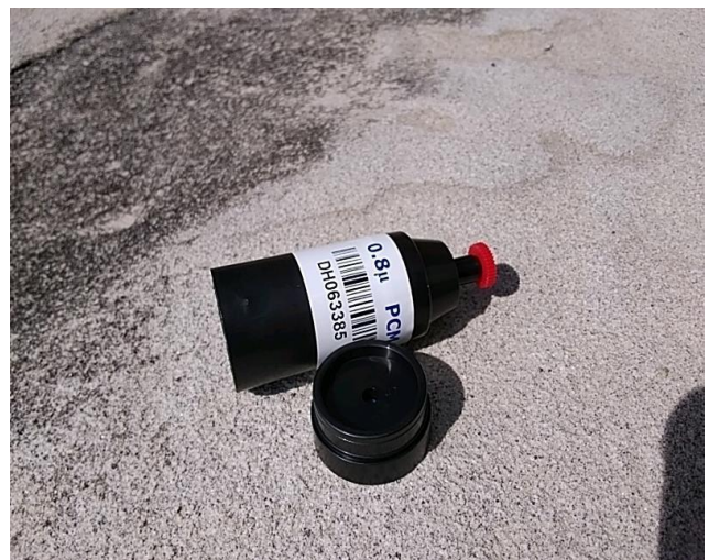
Location: Field blank Result: 0 fibres / 100 fields Image Id: 230316-104243