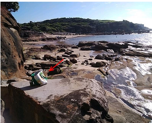
Location: Southern beach north end Result: <0.01 f/ml Image Id: 230316-090048