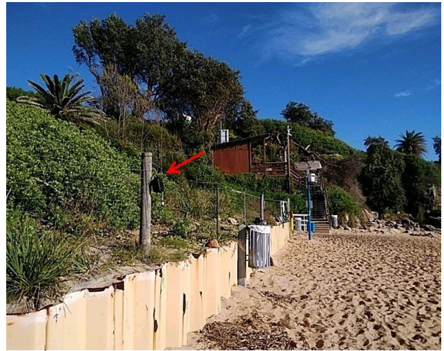
Location: Southern beach south end Result: <0.01 f/ml Image Id: 230316-085731