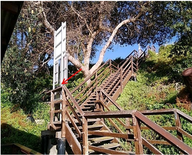
Location: Beach entrance Result: <0.01 f/ml Image Id: 230316-085531