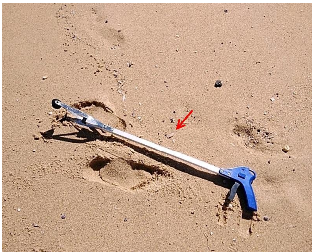
Notes: Overview of removal item within Southern beach prior to removal