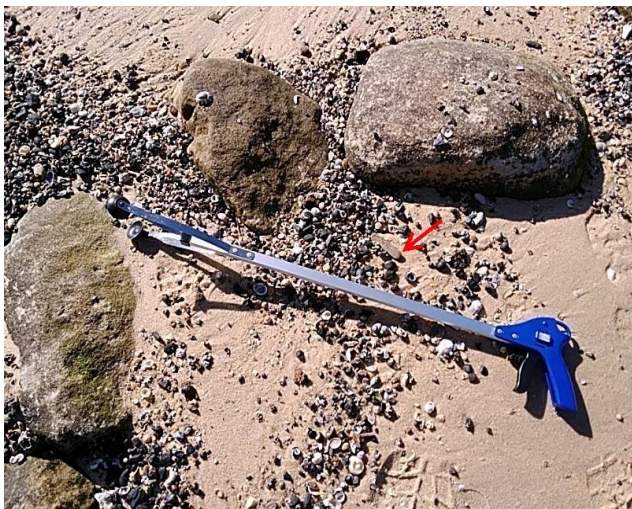
Notes: Overview of removal item within Northern beach prior to removal