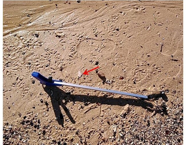
Notes: Overview of removal item within Northern beach prior to removal