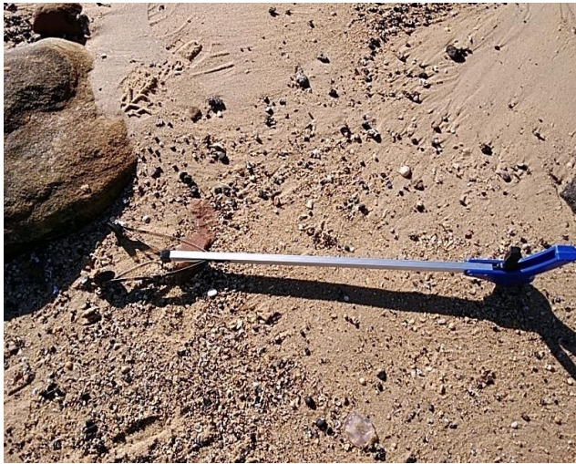
Notes: Visual inspection of removal item following removal