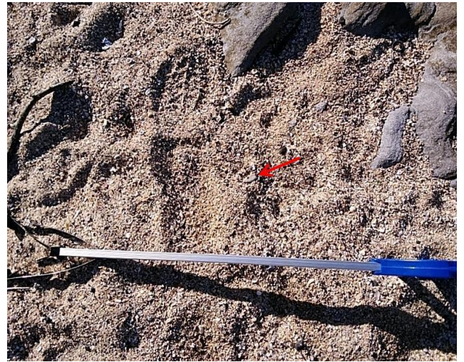
Notes: Overview of removal item within Northern beach prior to removal