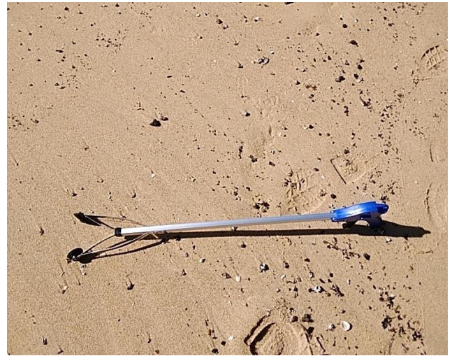
Notes: Visual inspection of removal item following removal