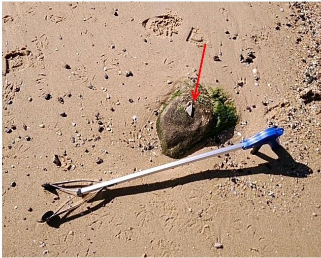
Notes: Overview of removal item within Western beach prior to removal