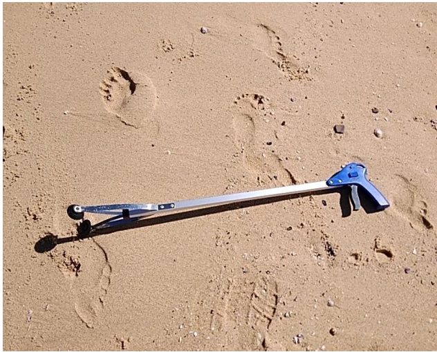
Notes: Visual inspection of removal item following removal