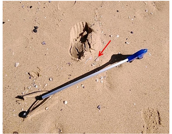
Notes: Overview of removal item within Southern beach prior to removal