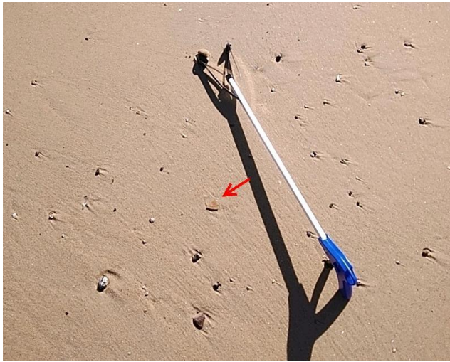
Notes: Overview of removal item within Northern beach prior to removal