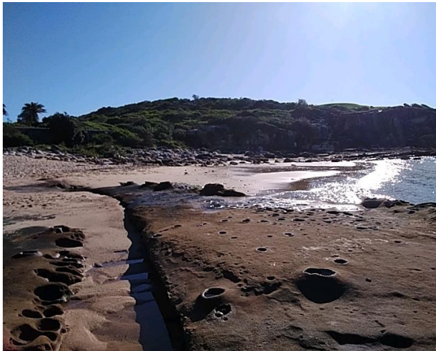
Notes: Overview of Northern Beach