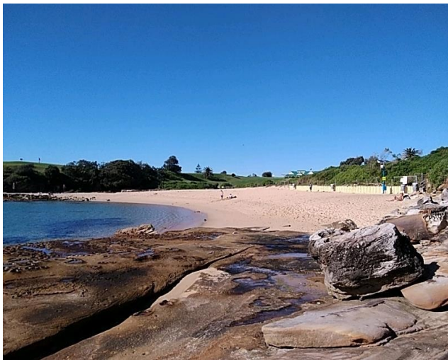
Notes: Overview of Southern Beach