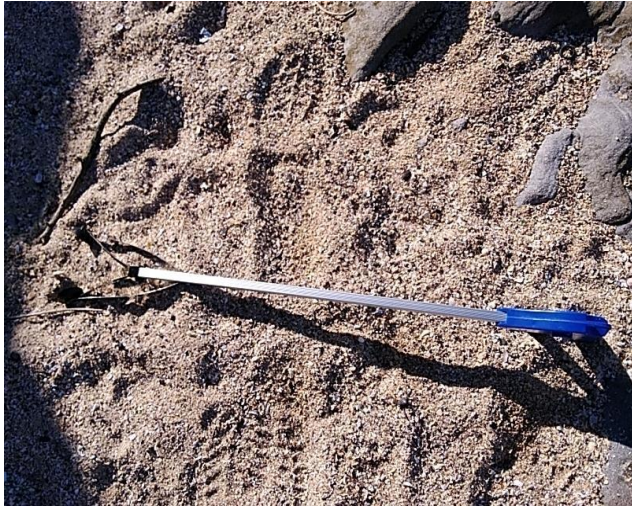
Notes: Visual inspection of removal item following removal