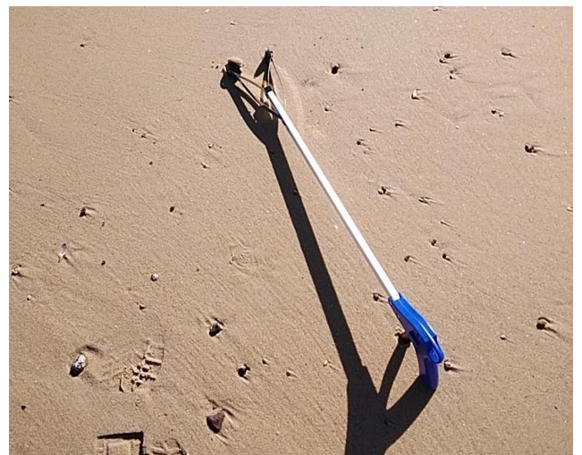
Notes: Visual inspection of removal item following removal