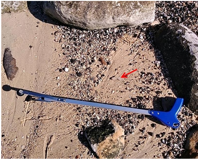
Notes: Overview of removal item within Northern beach prior to removal