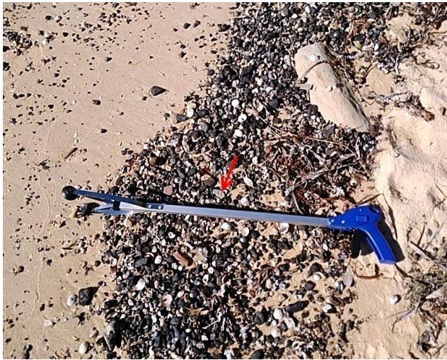
Notes: Overview of removal item within Western beach prior to removal