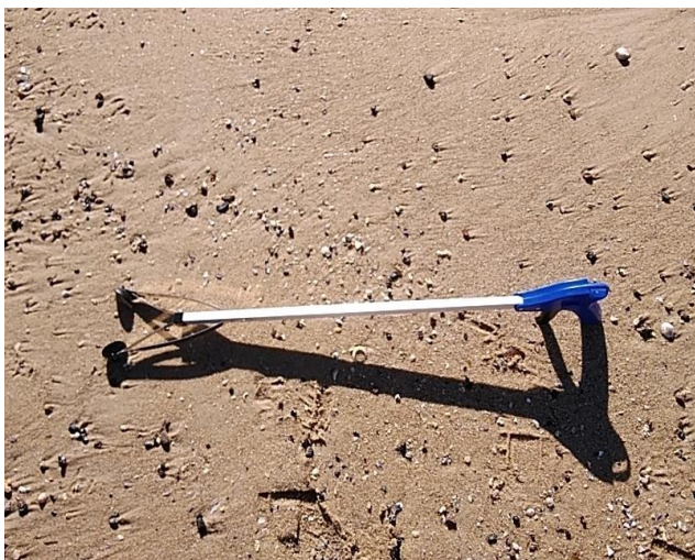
Notes: Visual inspection of removal item following removal