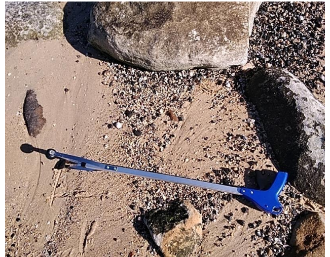
Notes: Visual inspection of removal item following removal