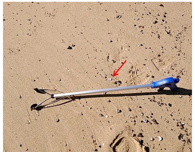
Notes: Overview of removal item within Western beach prior to removal