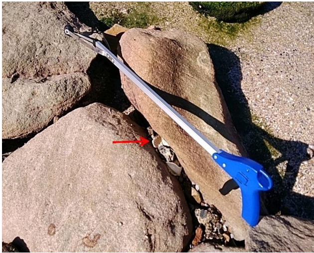
Notes: Overview of removal item within Southern beach prior to removal