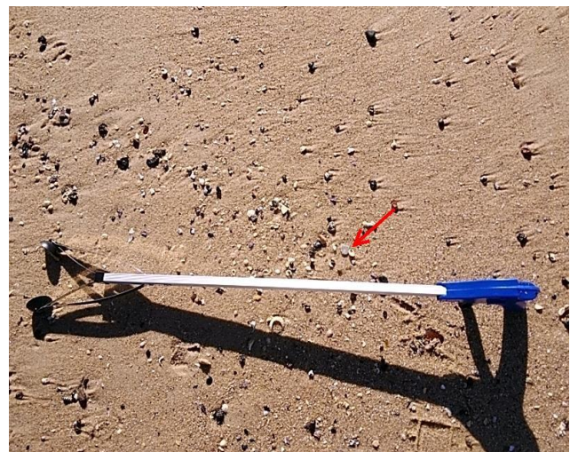
Notes: Overview of removal item within Northern beach prior to removal