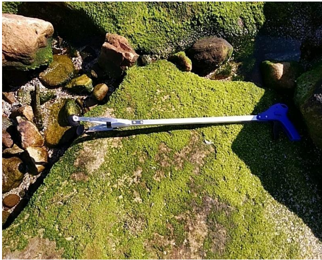
Notes: Visual inspection of removal item following removal