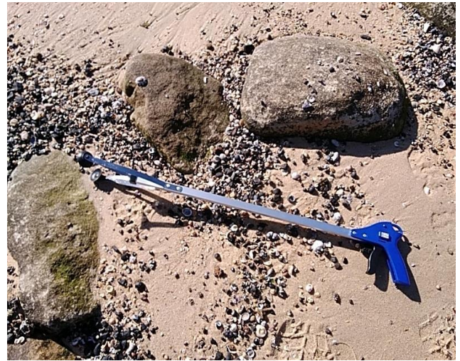
Notes: Visual inspection of removal item following removal