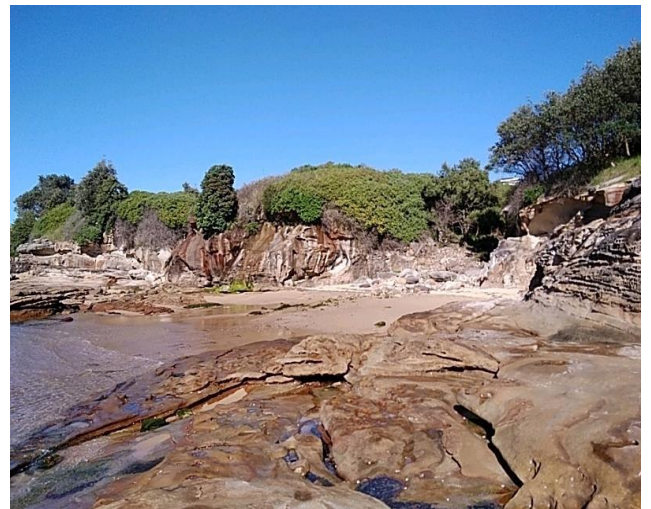
Notes: Overview of Western Beach