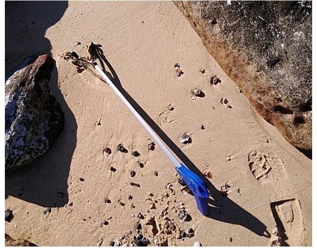
Notes: Visual inspection of removal item following removal