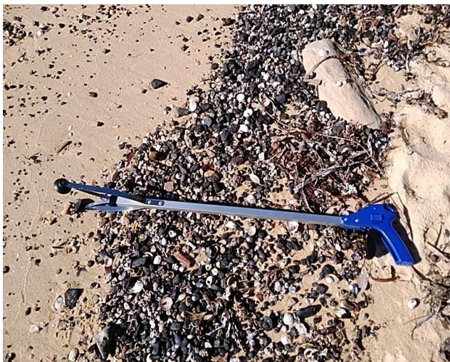
Notes: Visual inspection of removal item following removal