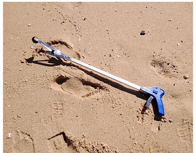
Notes: Visual inspection of removal item following removal