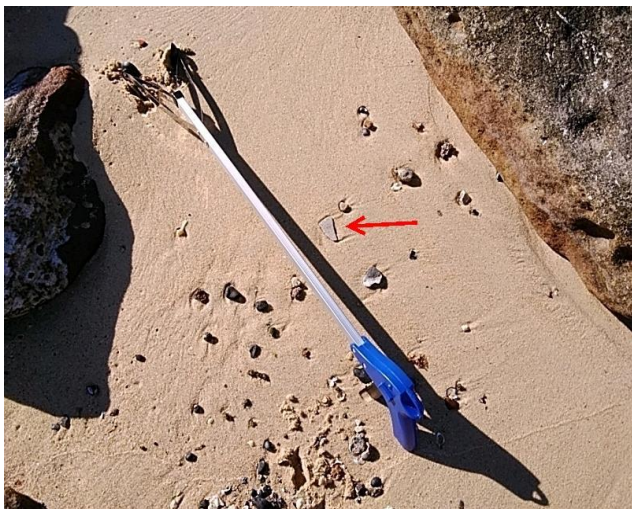
Notes: Overview of removal item within Northern beach prior to removal