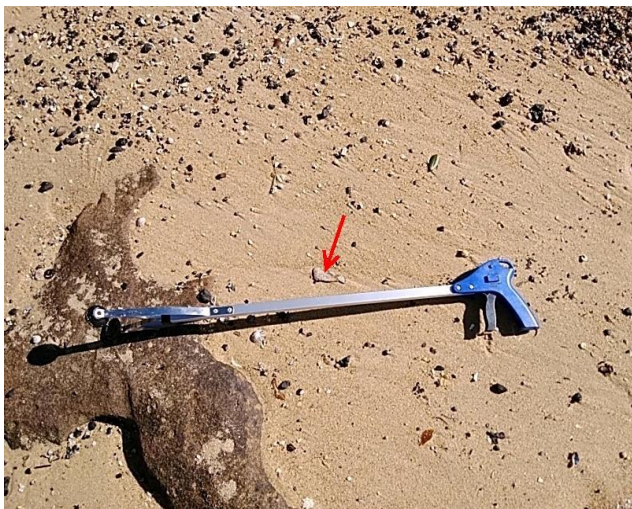
Notes: Overview of removal item within Western beach prior to removal