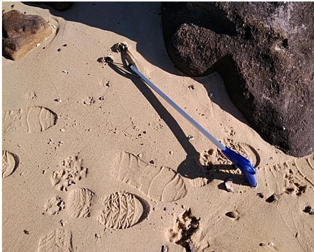
Notes: Visual inspection of removal item following removal