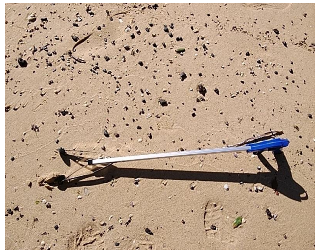
Notes: Visual inspection of removal item following removal