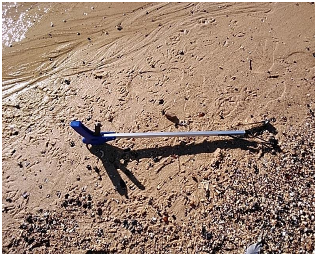
Notes: Visual inspection of removal item following removal