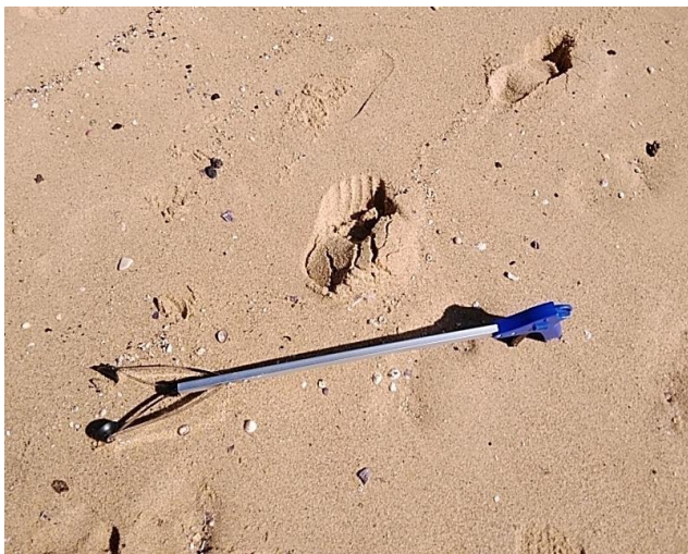
Notes: Visual inspection of removal item following removal