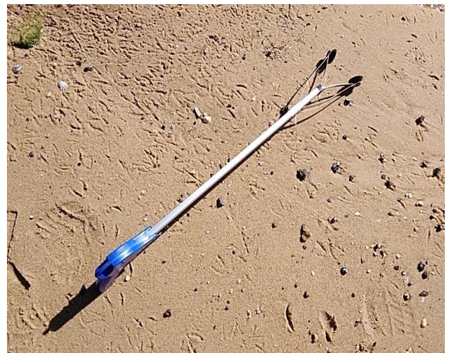
Notes: Visual inspection of removal item following removal