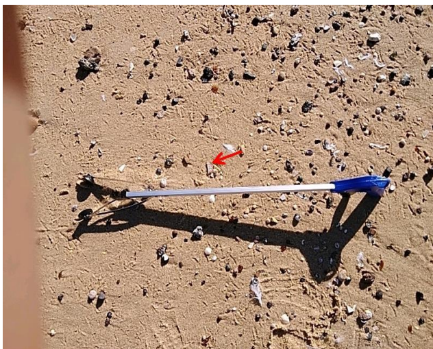
Notes: Overview of removal item within Northern beach prior to removal