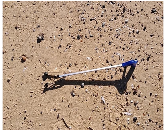
Notes: Visual inspection of removal item following removal