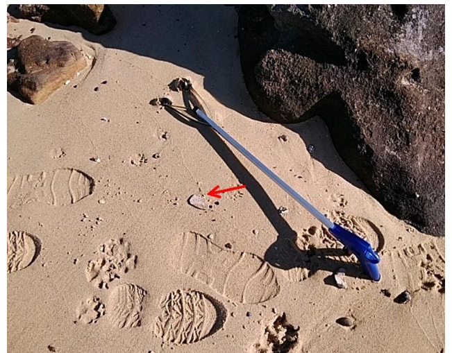
Notes: Overview of removal item within Northern beach prior to removal