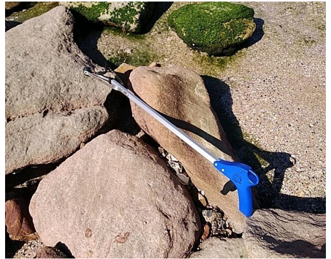
Notes: Visual inspection of removal item following removal