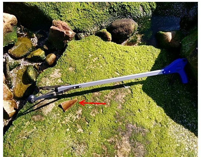
Notes: Overview of removal item within Southern beach prior to removal