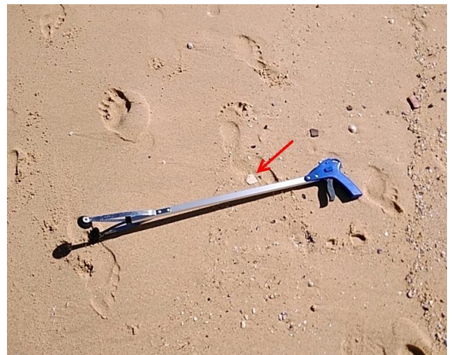
Notes: Overview of removal item within Southern beach prior to removal