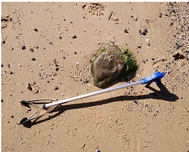
Notes: Visual inspection of removal item following removal