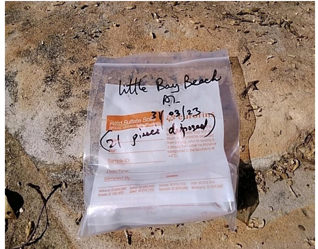
Notes: Waste disposal management