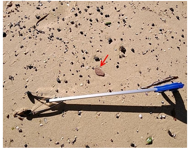
Notes: Overview of removal item within Western beach prior to removal