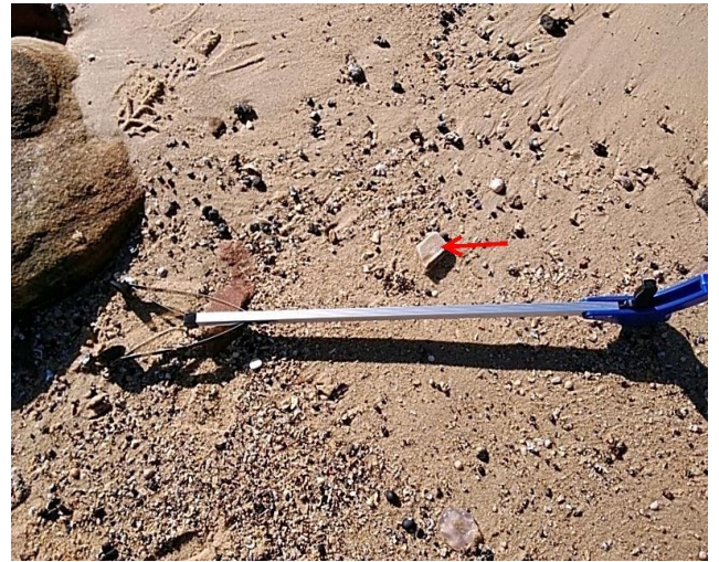
Notes: Overview of removal item within Northern beach prior to removal