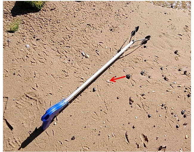
Notes: Overview of removal item within Western beach prior to removal