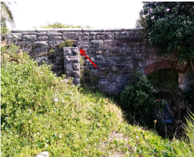
Location: Northern elevation, on stone retaining wall Result: <0.01 f/ml Image Id: 230215-101324