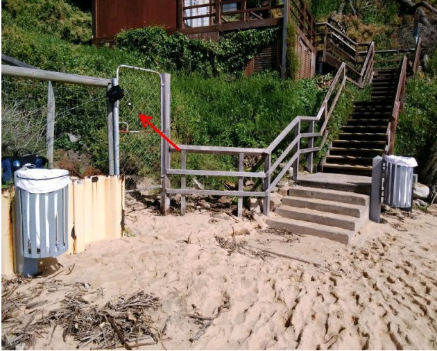
Location: Western elevation, Beach entry, on fence Result: 0 fibres / 100 fields Image Id: 230215-100459