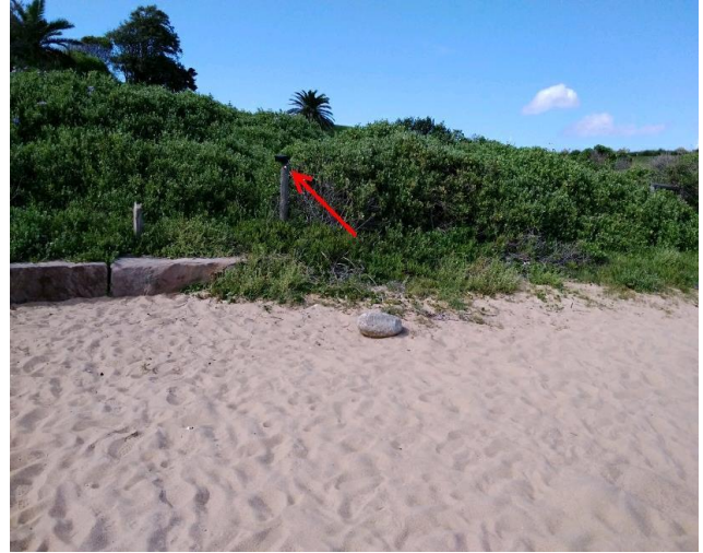
Location: Southern elevation, on pole Result: <0.01 f/ml Image Id: 230215-100752