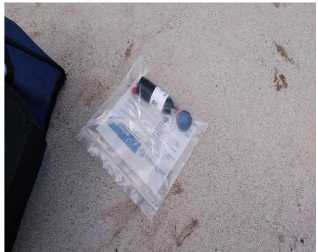
Location: Field blank Result: 0 fibres / 100 fields Image Id: 230215-125149