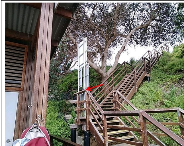
Location: Beach entrance Result: <0.01 f/ml Image Id: 230131-094810