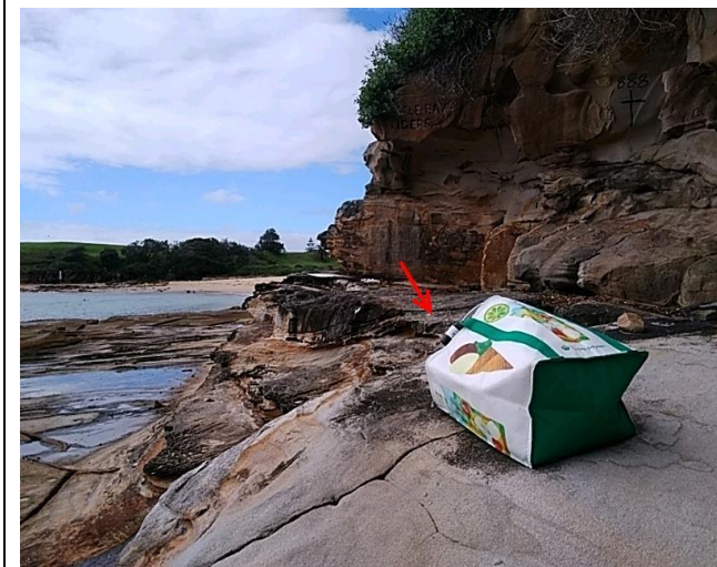
Location: Southern beach north end Result: <0.01 f/ml Image Id: 230131-095339