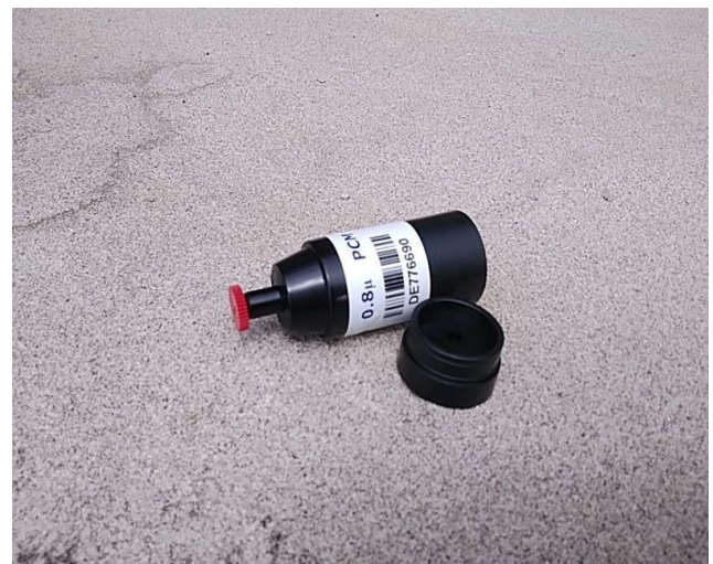
Location: Field blank Result: 0 fibres / 100 fields Image Id: 230131-110921