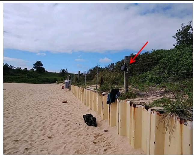
Location: Southern beach north end Result: <0.01 f/ml Image Id: 230131-095005