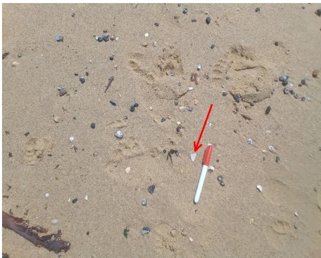
Notes: Overview of the ACM fragment prior to the removal within Northern beach.