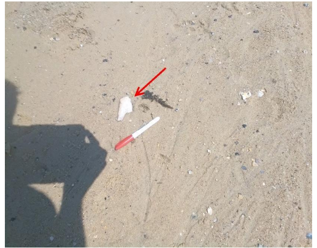
Notes: Overview of the ACM fragment prior to the removal within Northern beach.