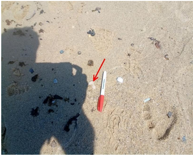
Notes: Overview of the ACM fragment prior to the removal within Northern beach.