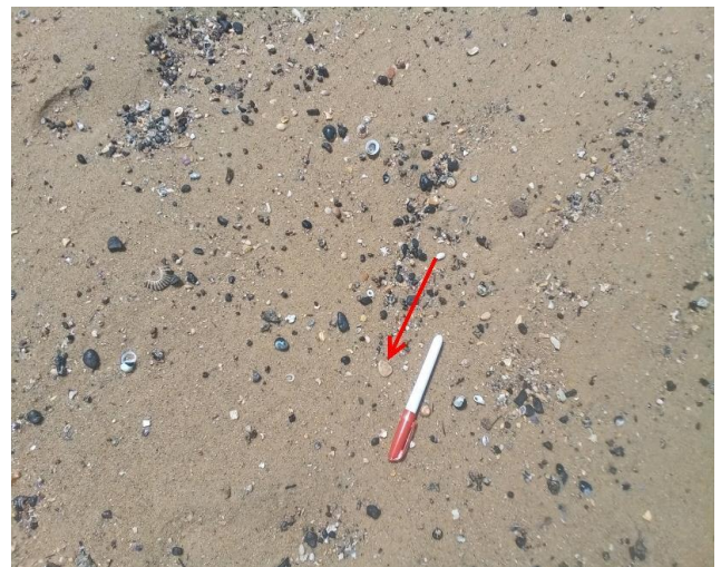
Notes: Overview of the ACM fragment prior to the removal within Northern beach.