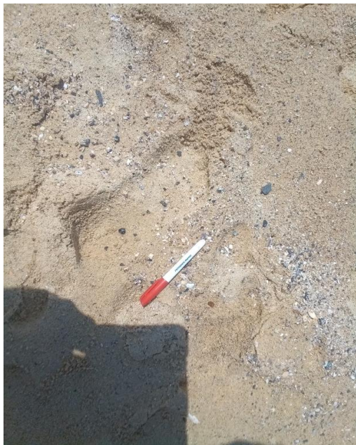
Notes: Visual surface clearance inspection following removal of ACM fragment.