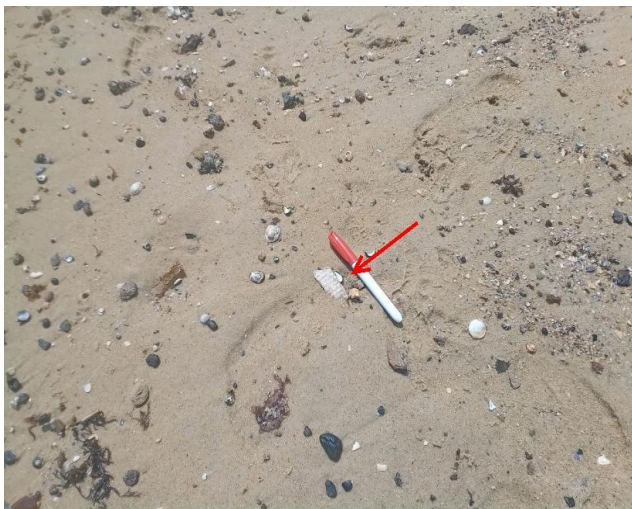
Notes: Overview of the ACM fragment prior to the removal within Northern beach.