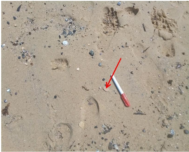
Notes: Overview of the ACM fragment prior to the removal within Northern beach.