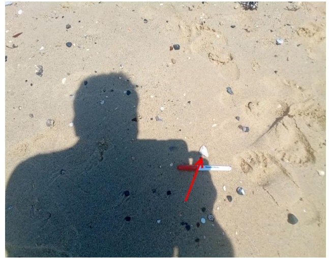
Notes: Overview of the ACM fragment prior to the removal within Northern beach.