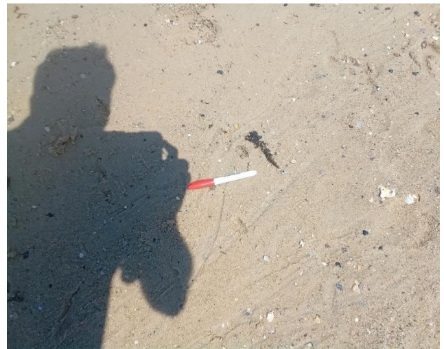
Notes: Visual surface clearance inspection following removal of ACM fragment.