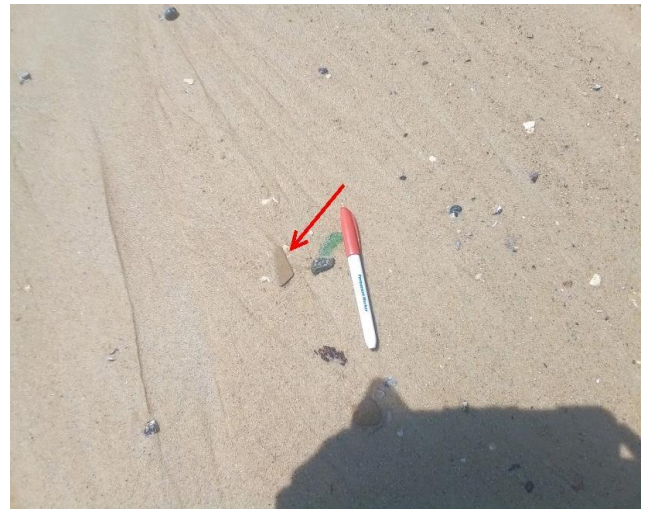
Notes: Overview of the ACM fragment prior to the removal within Western beach.