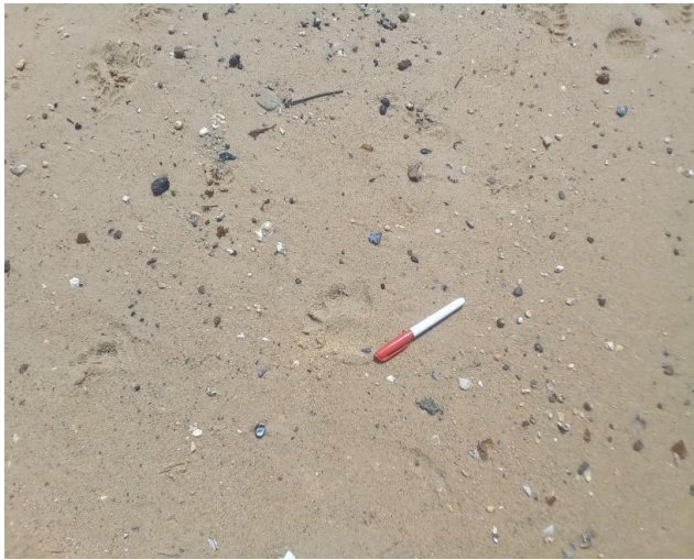
Notes: Visual surface clearance inspection following removal of ACM fragment.