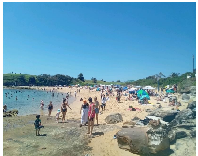
Notes: Overview of the Southern beach.