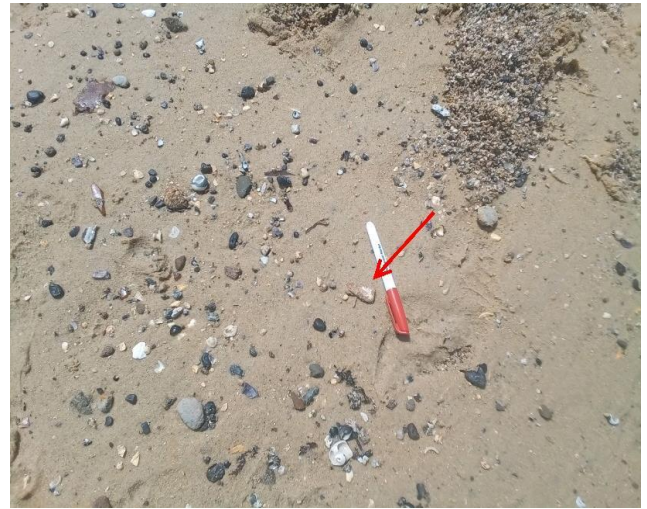
Notes: Overview of the ACM fragment prior to the removal within Northern beach.