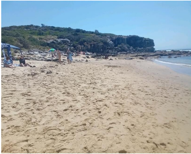
Notes: Overview of the Northern beach.