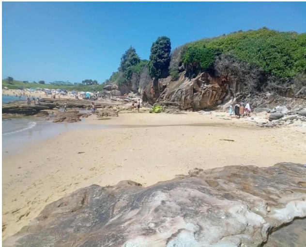
Notes: Overview of the Western beach.