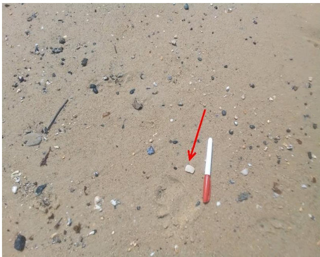
Notes: Overview of the ACM fragment prior to the removal within Northern beach.