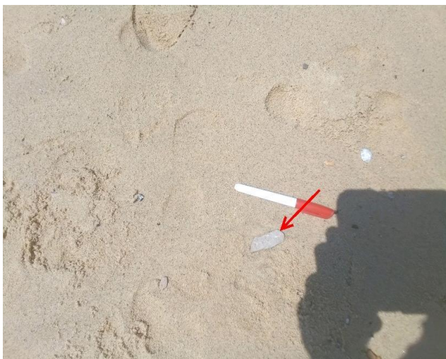
Notes: Overview of the ACM fragment prior to the removal within Western beach.