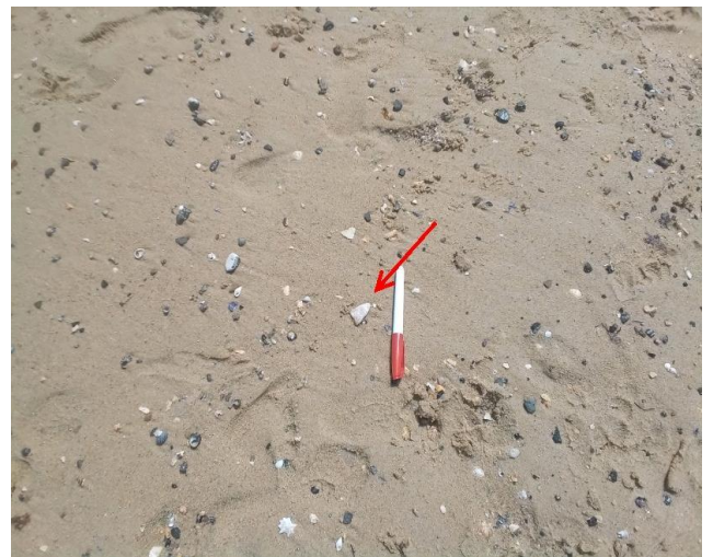
Notes: Overview of the ACM fragment prior to the removal within Northern beach.