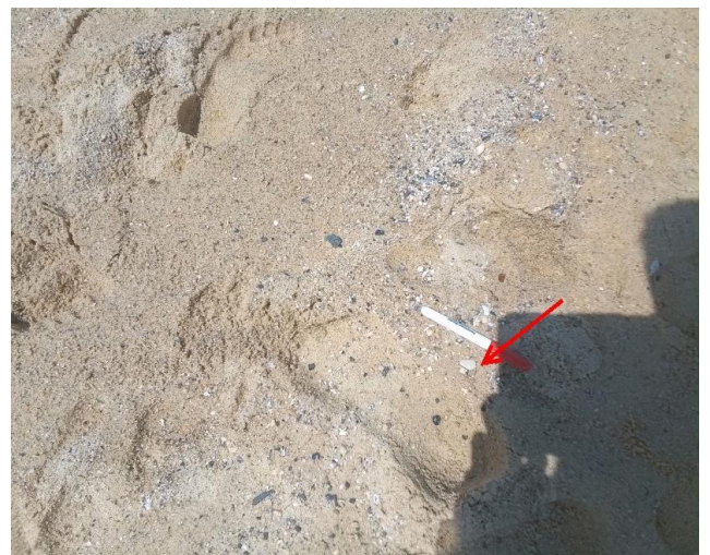
Notes: Overview of the ACM fragment prior to the removal within Western beach.