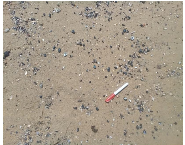
Notes: Visual surface clearance inspection following removal of ACM fragment.