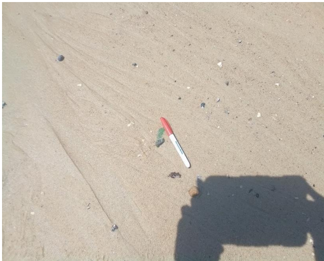
Notes: Visual surface clearance inspection following removal of ACM fragment.