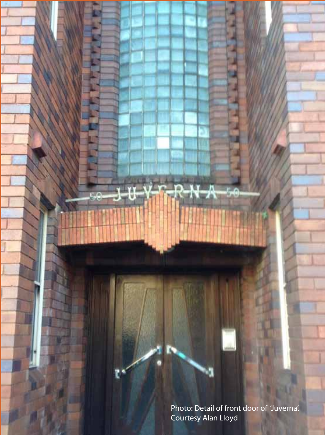
Photo: Detail of front door of 'Juverna'