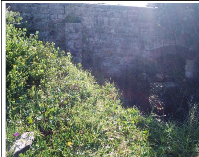
Location: Northern elevation, on stone retaining wall Result: <0.01 f/ml Image Id: 230506-083909