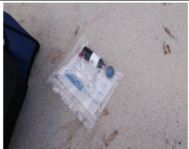
Location: Field blank Result: 0 fibres / 100 fields Image Id: 230506-083921