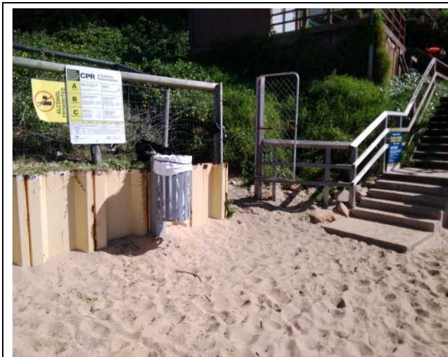
Location: Western elevation, Beach entry, on fence Result: <0.01 f/ml Image Id: 230506-083901