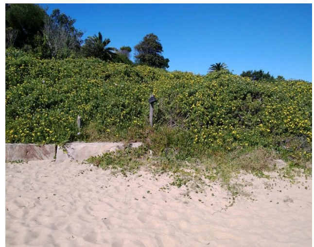
Location: Southern elevation, on pole Result: <0.01 f/ml Image Id: 230506-083905