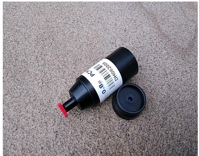
Location: Field Blank Result: 0 fibres / 100 fields Image Id: 230413-100109