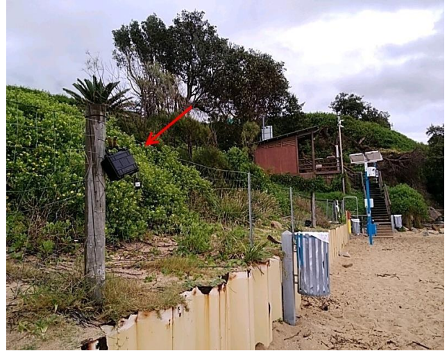
Location: Southern beach south end Result: <0.01 f/ml Image Id: 230413-095839