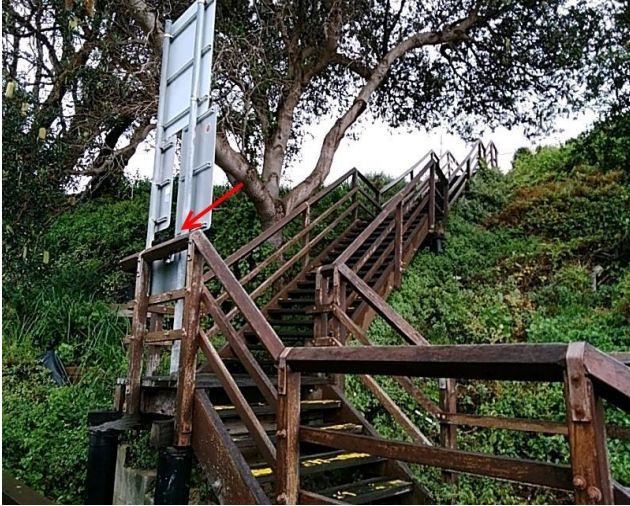
Location: Beach entrance Result: <0.01 f/ml Image Id: 230413-095633