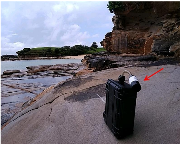
Location: Southern beach north end Result: <0.01 f/ml Image Id: 230413-100105