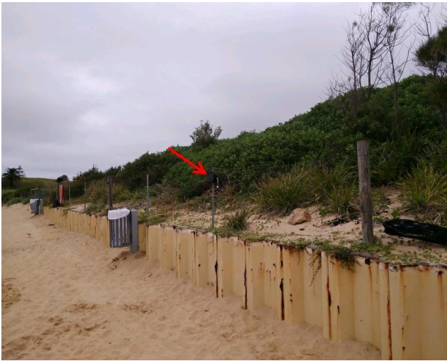
Location: Southern beach, on perimeter fence. Result: <0.01 f/ml Image Id: 221225-074208