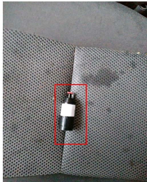
Location: Field Blank Result: 0 fibres / 100 fields Image Id: 221228-133605