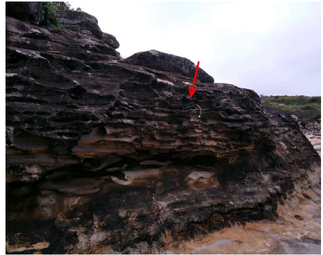
Location: Northern Beach, on rock. Result: <0.01 f/ml Image Id: 221225-074554