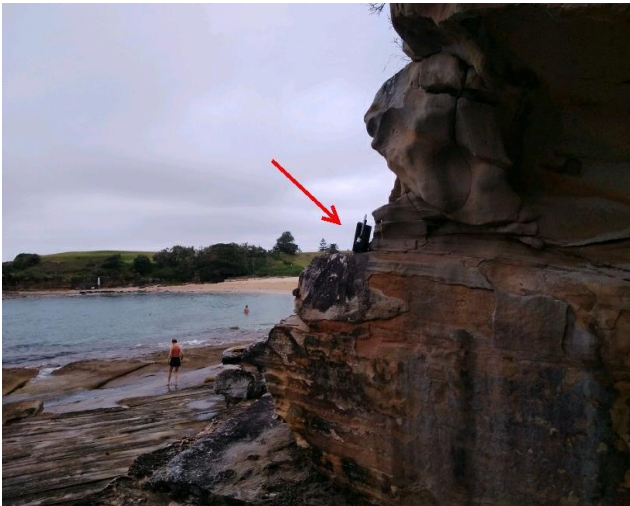
Location: Western Beach, on rock. Result: <0.01 f/ml Image Id: 221225-074830