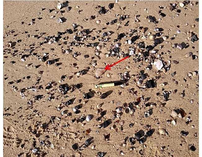
Notes: Overview of removal item within Northern beach prior to removal