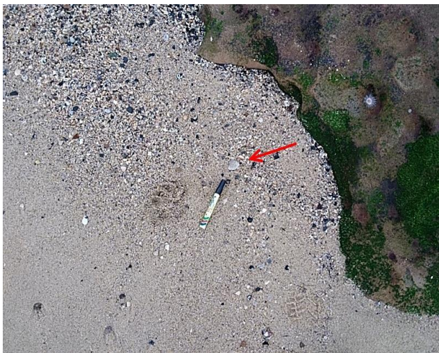
Notes: Overview of removal item within Western beach prior to removal