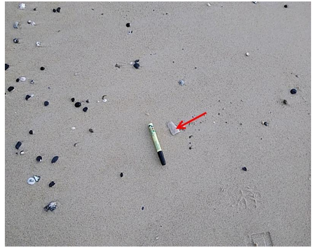
Notes: Overview of removal item within Western beach prior to removal