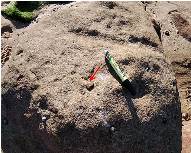
Notes: Overview of removal item within Northern beach prior to removal