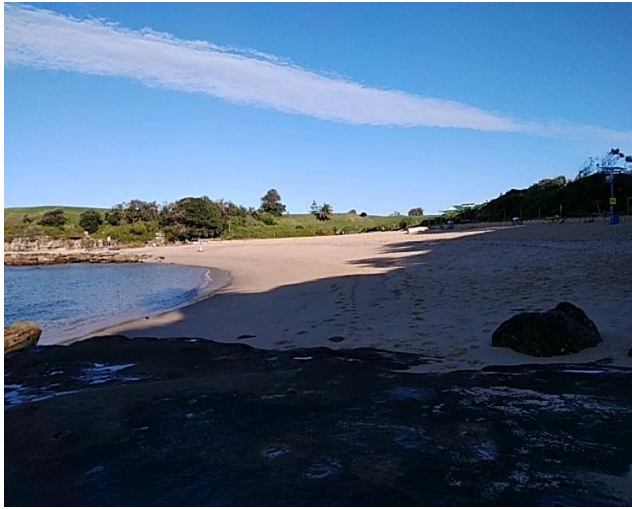
Notes: Overview of the Southern beach