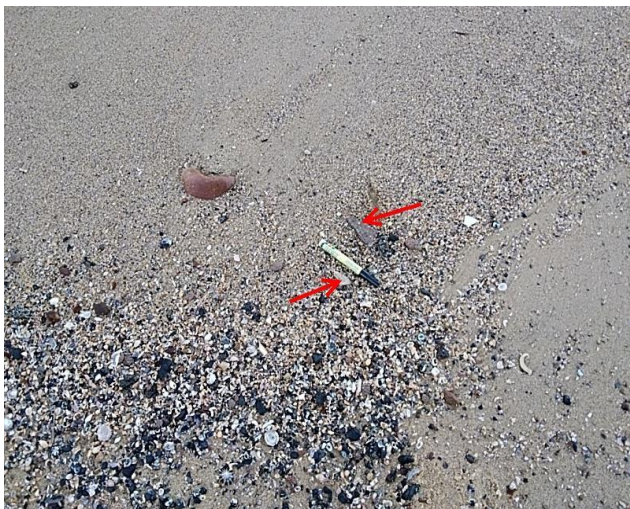
Notes: Overview of removal item within Western beach prior to removal