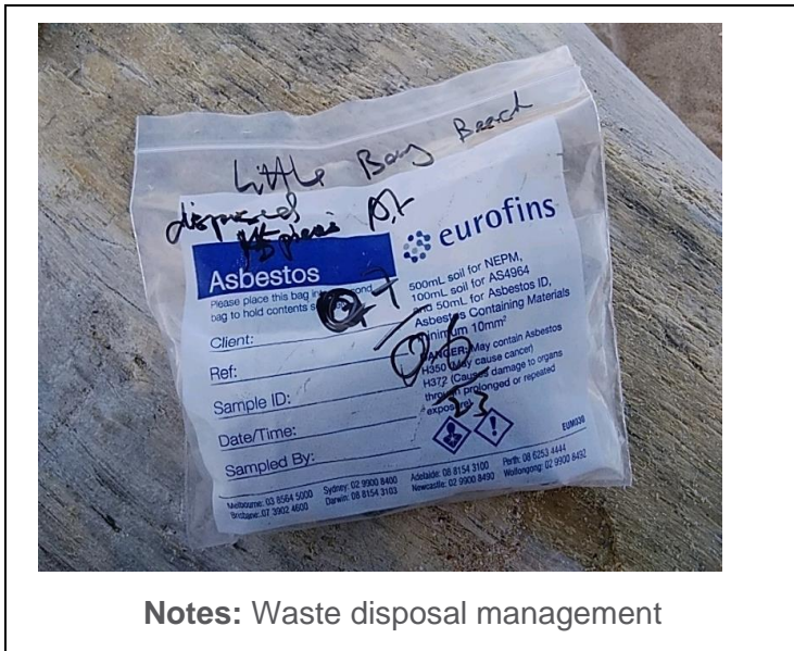
Notes: Waste disposal management