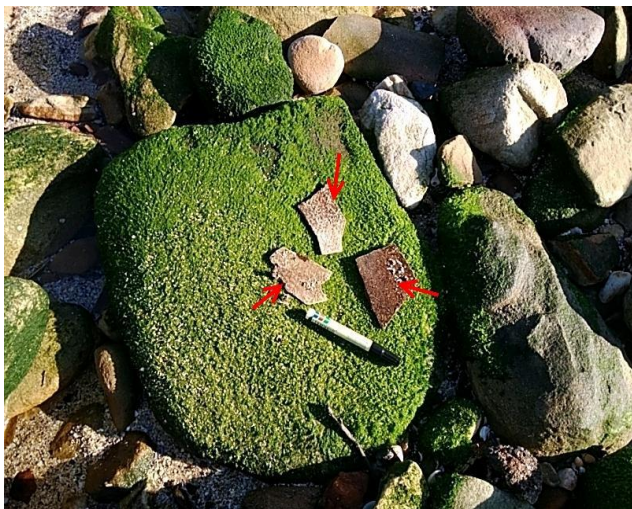
Notes: Overview of removal item within Southern beach prior to removal