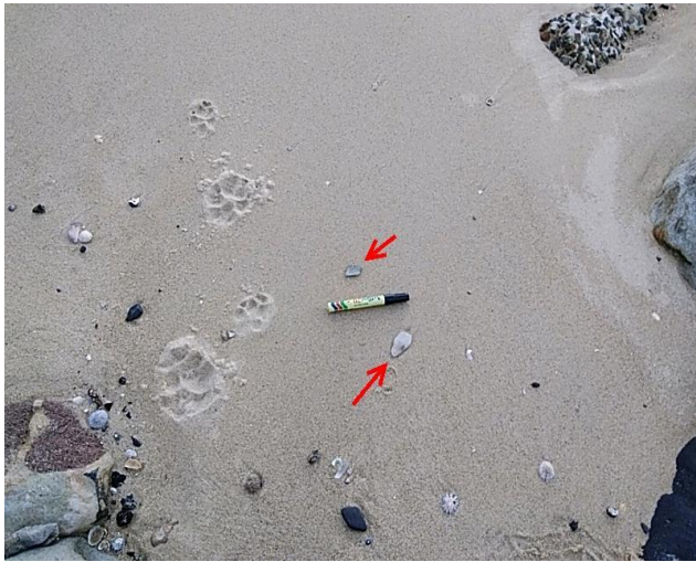
Notes: Overview of removal item within Western beach prior to removal