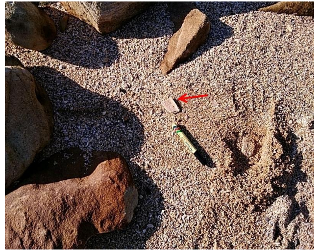
Notes: Overview of removal item within Southern beach prior to removal