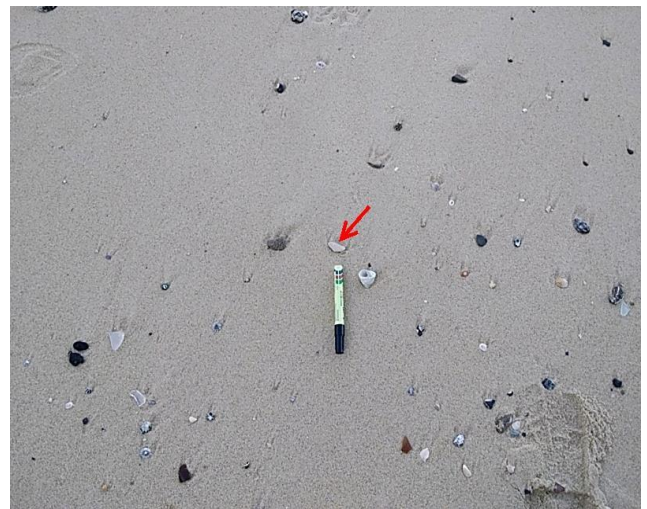
Notes: Overview of removal item within Western beach prior to removal