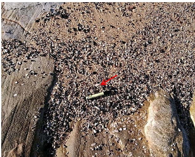
Notes: Overview of removal item within Northern beach prior to removal