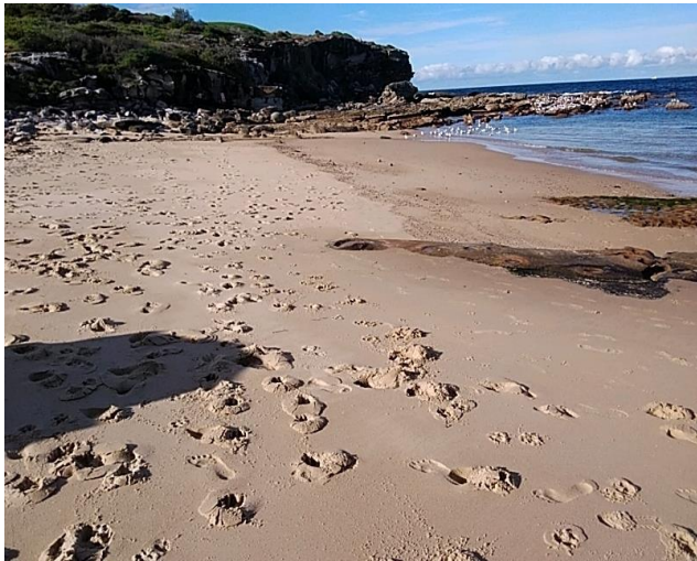
Notes: Overview of the Northern beach