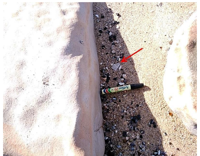
Notes: Overview of removal item within Northern beach prior to removal