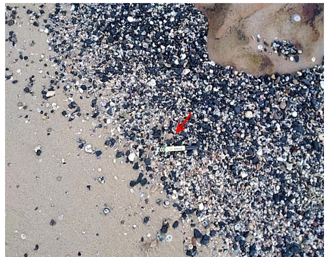
Notes: Overview of removal item within Western beach prior to removal