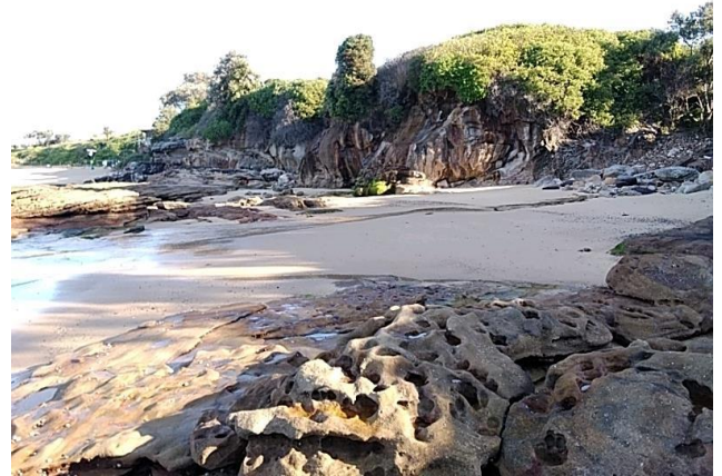
Notes: Overview of the Western beach