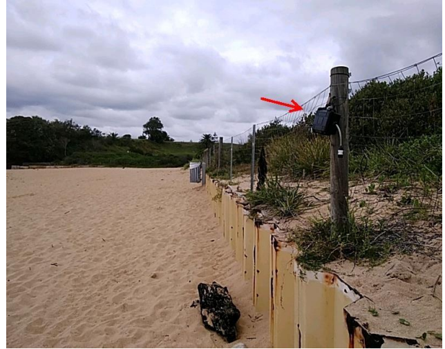
Location: Southern beach south end Result: <0.01 f/ml Image Id: 230111-082513