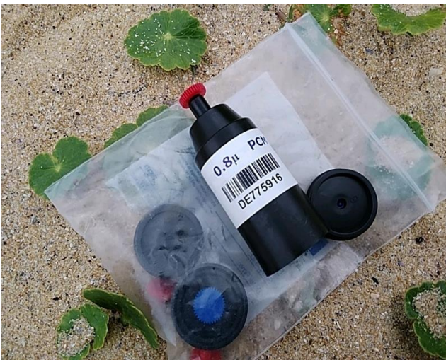
Location: Field Blank Result: 0 fibres / 100 fields Image Id: 230111-082631