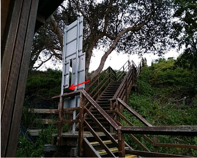
Location: Beach entrance Result: <0.01 f/ml Image Id: 230111-082141