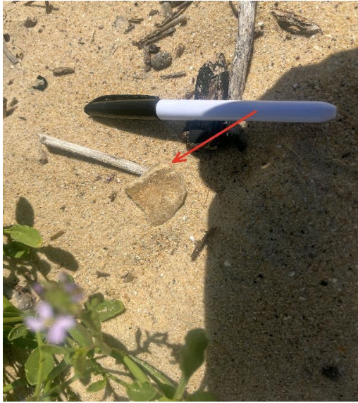
Notes: Overview of ACM fragment within Northern beach.