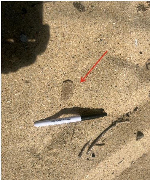
Notes: Overview of ACM fragment within Northern beach.