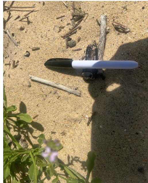
Notes: Visual surface inspection following removal of ACM fragment.