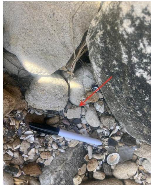
Notes: Overview of ACM fragment within Southern beach.