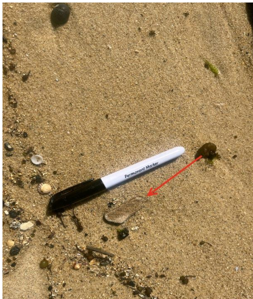
Notes: Overview of ACM fragment within Southern beach.