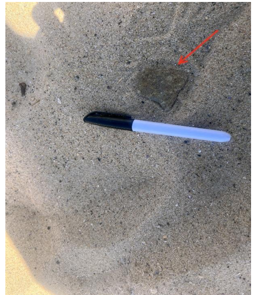
Notes: Overview of ACM fragment within Northern beach.