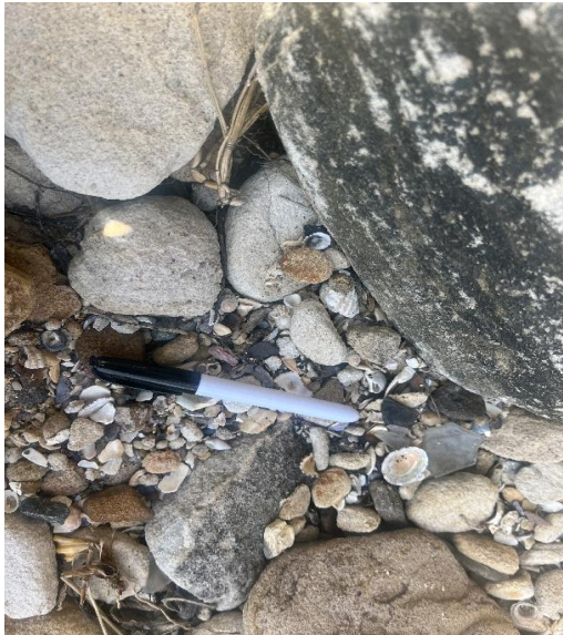
Notes: Visual surface inspection following removal of ACM fragment.