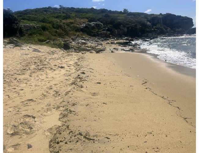
Notes: Overview of Northern beach.