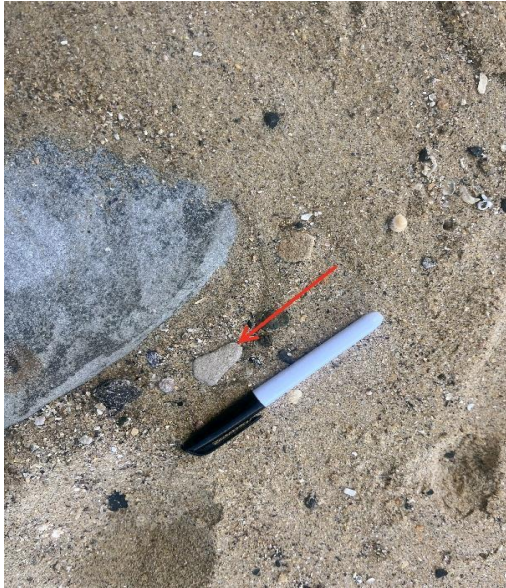
Notes: Overview of ACM fragment within Western beach.