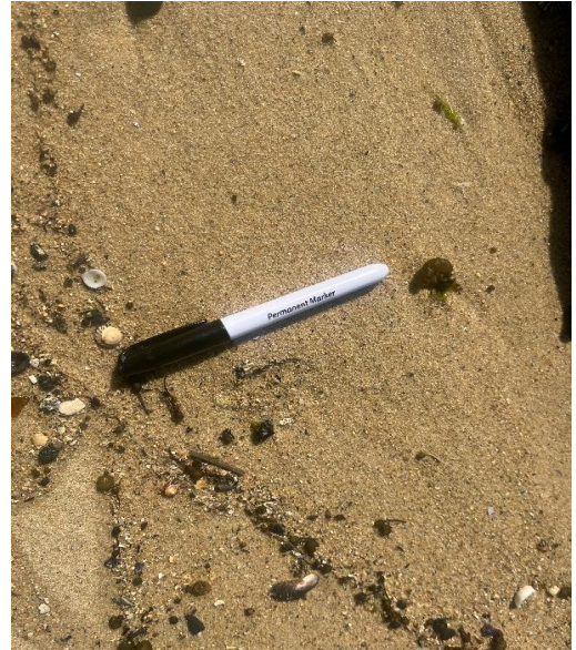
Notes: Visual surface inspection following removal of ACM fragment.