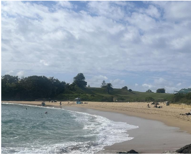
Notes: Overview of Southern beach.