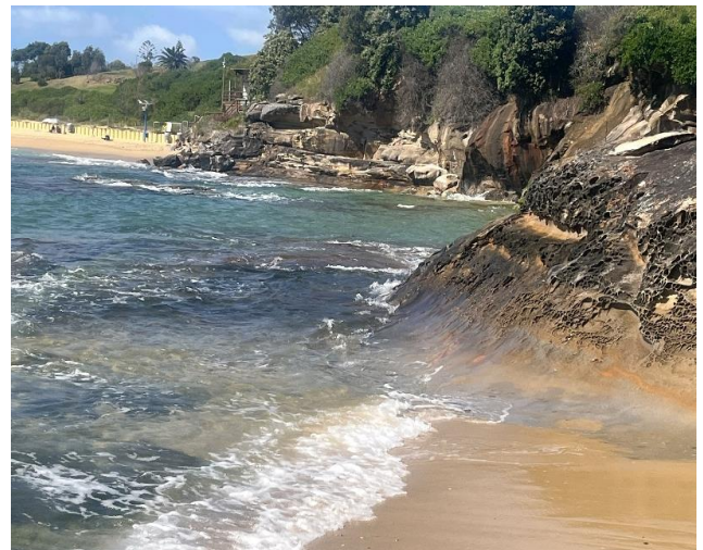
Notes: Overview of Western beach.