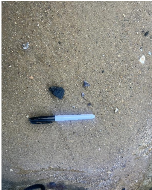
Notes: Visual surface inspection following removal of ACM fragment.