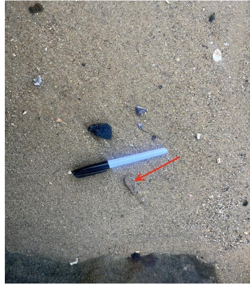
Notes: Overview of ACM fragment within Northern beach.