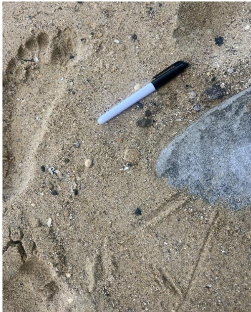
Notes: Visual surface inspection following removal of ACM fragment.