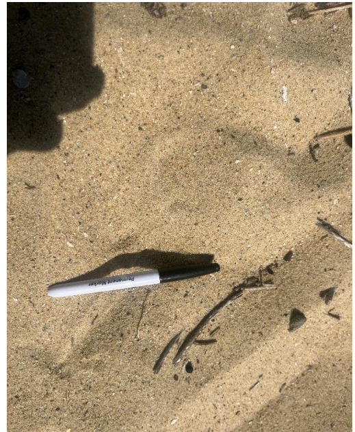
Notes: Visual surface inspection following removal of ACM fragment.