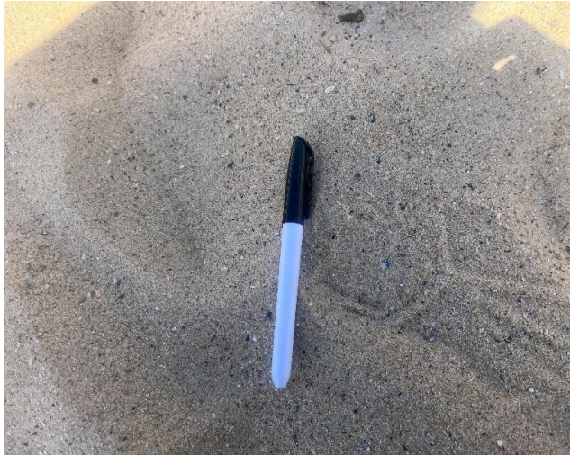
Notes: Visual surface inspection following removal of ACM fragment.