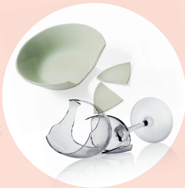
✓ Broken glass and crockery