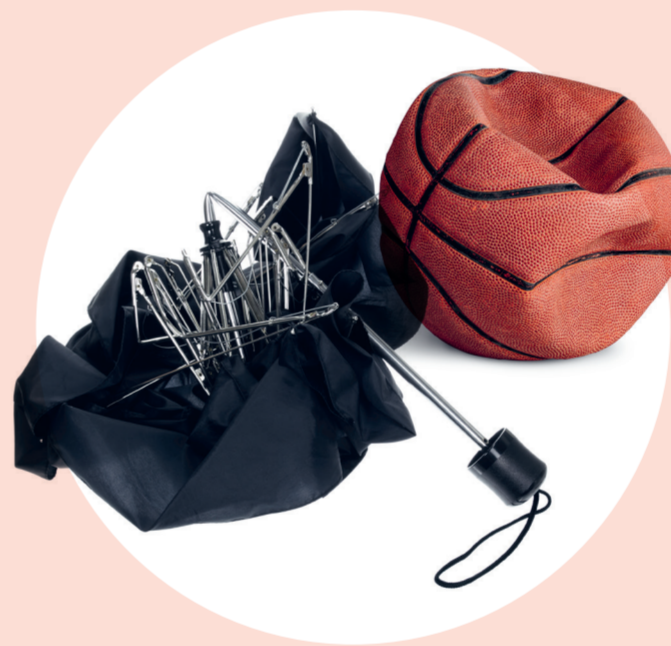
✓ Broken household items