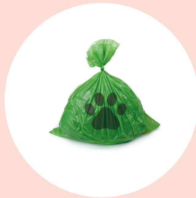
✓ Pet waste