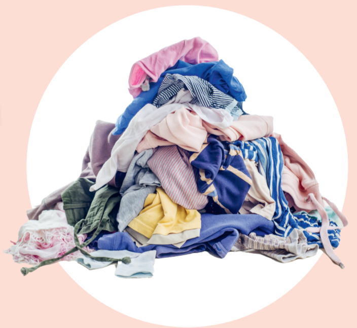
✓ Unusable clothing and textiles