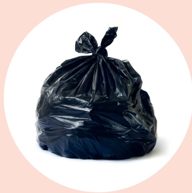
✓ Plastic bags