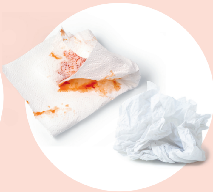
✓ Tissues and paper towels